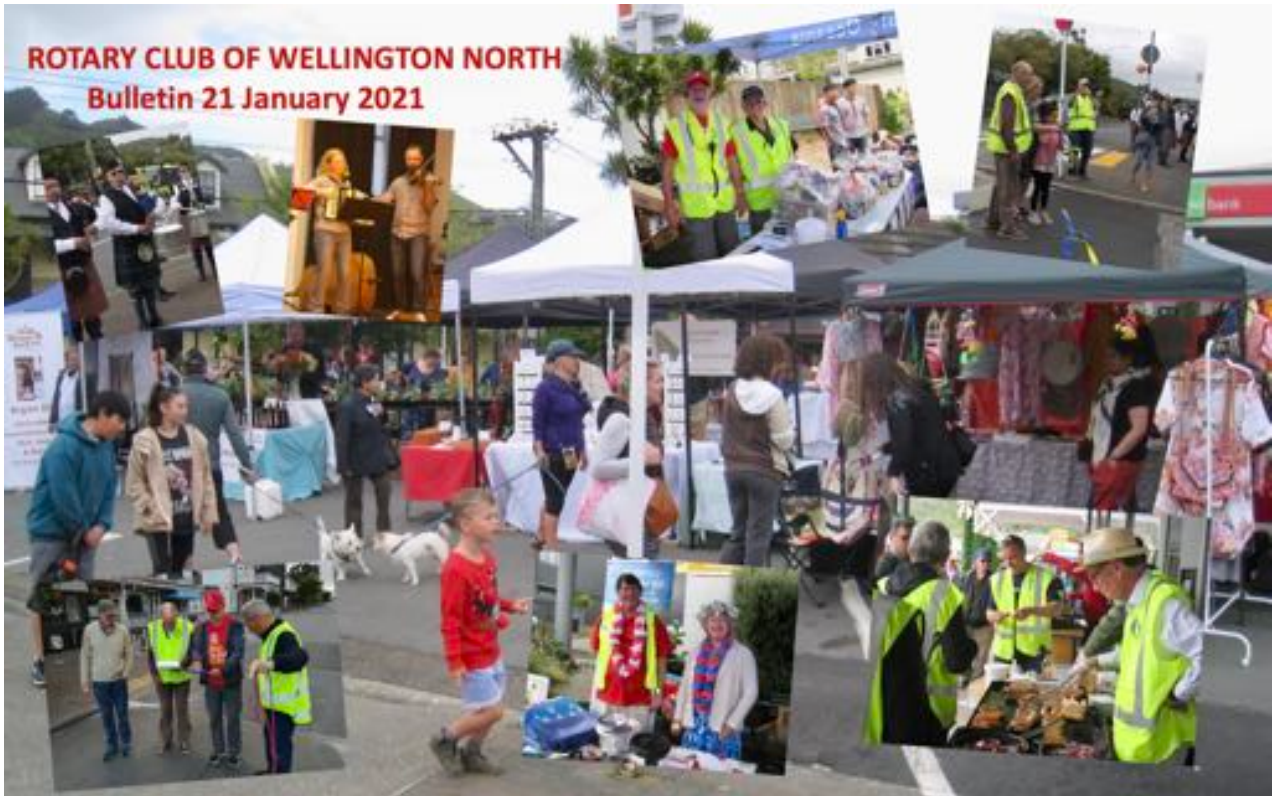
All the fun of the Khandallah Village Fair