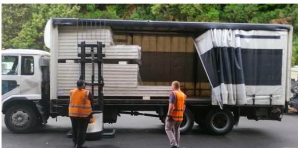
New freezer components being unloaded

Whilst we built a brand-new chiller and freezer room at our new warehouse in July 2020, we have already outgrown it.