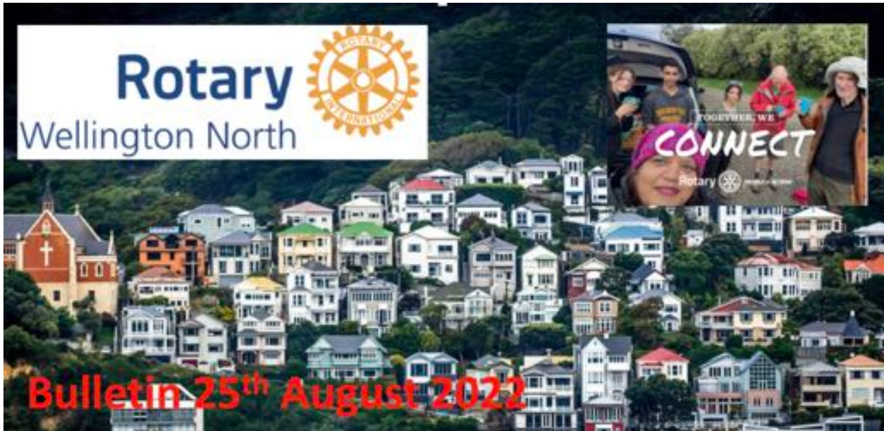
Oriental Bay – Little houses on a hillside. Inset - Tree planting