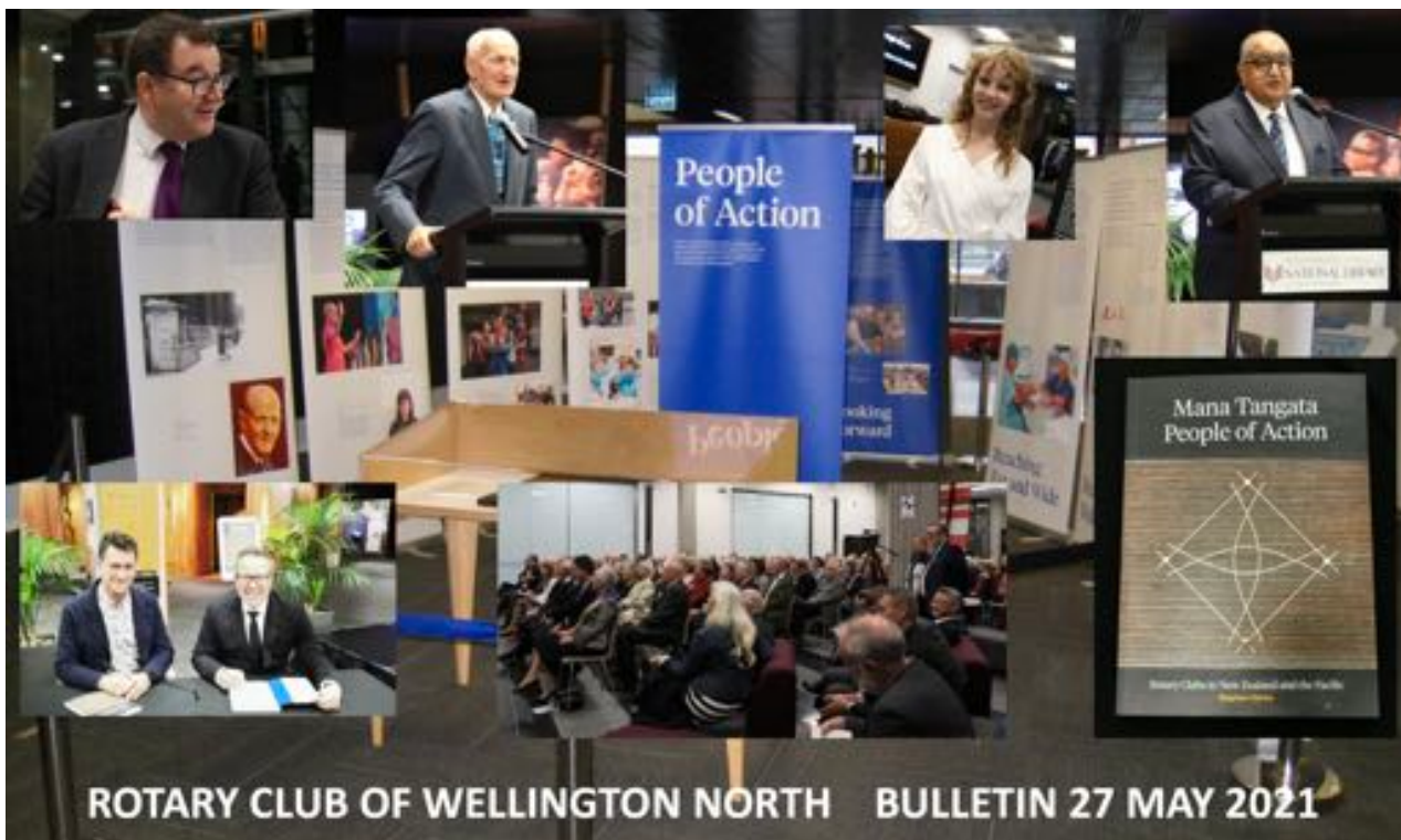
Launch of Mana Tangata – People of Action at the National Library 12 May 2021