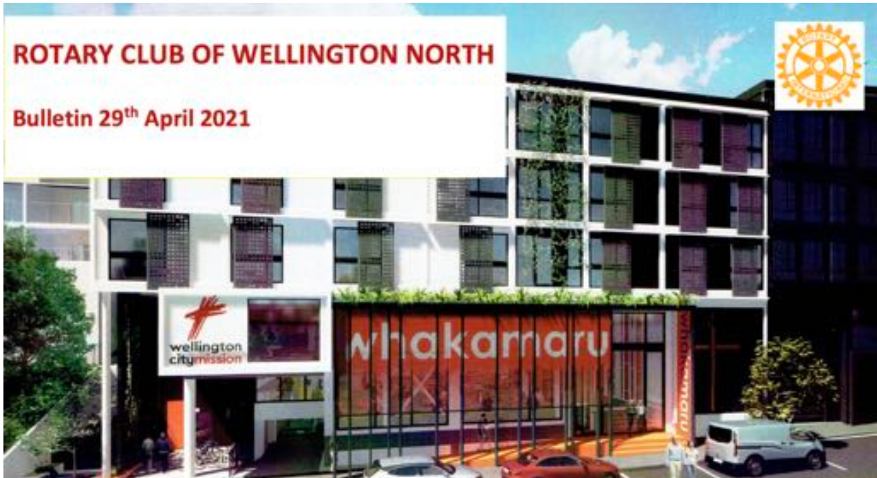
Whakamaru –The new multi- purpose facility being developed for the Wellington City Mission