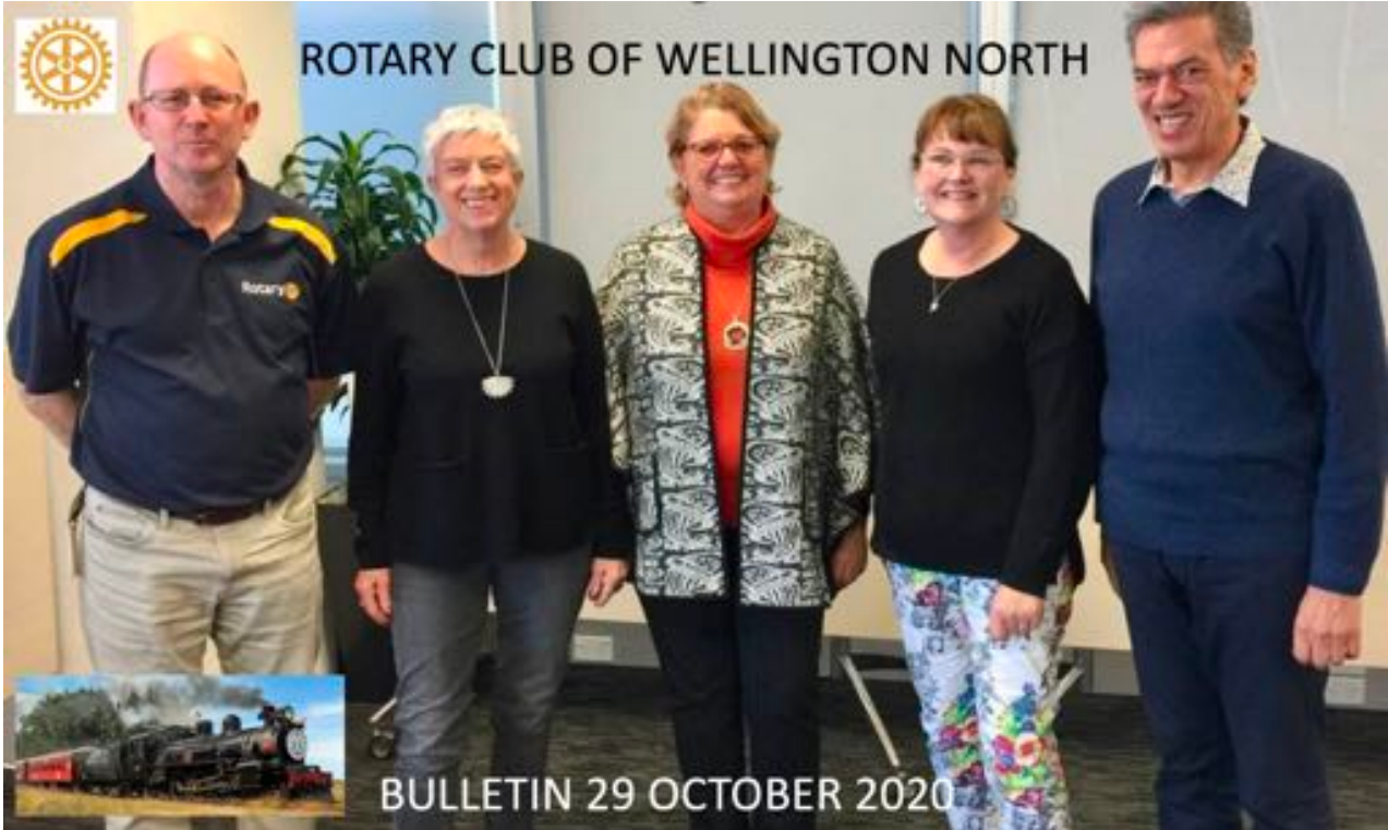
Steaming ahead to 2021 – The District 9940 DG Train