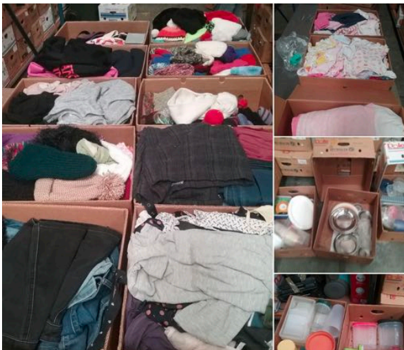
Boxes of clothing etc. awaiting distribution

As well as food KCA has distributed a lot of non-food items, including toiletries clothing, car seats etc.