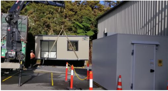
Delivery of the Portalodge