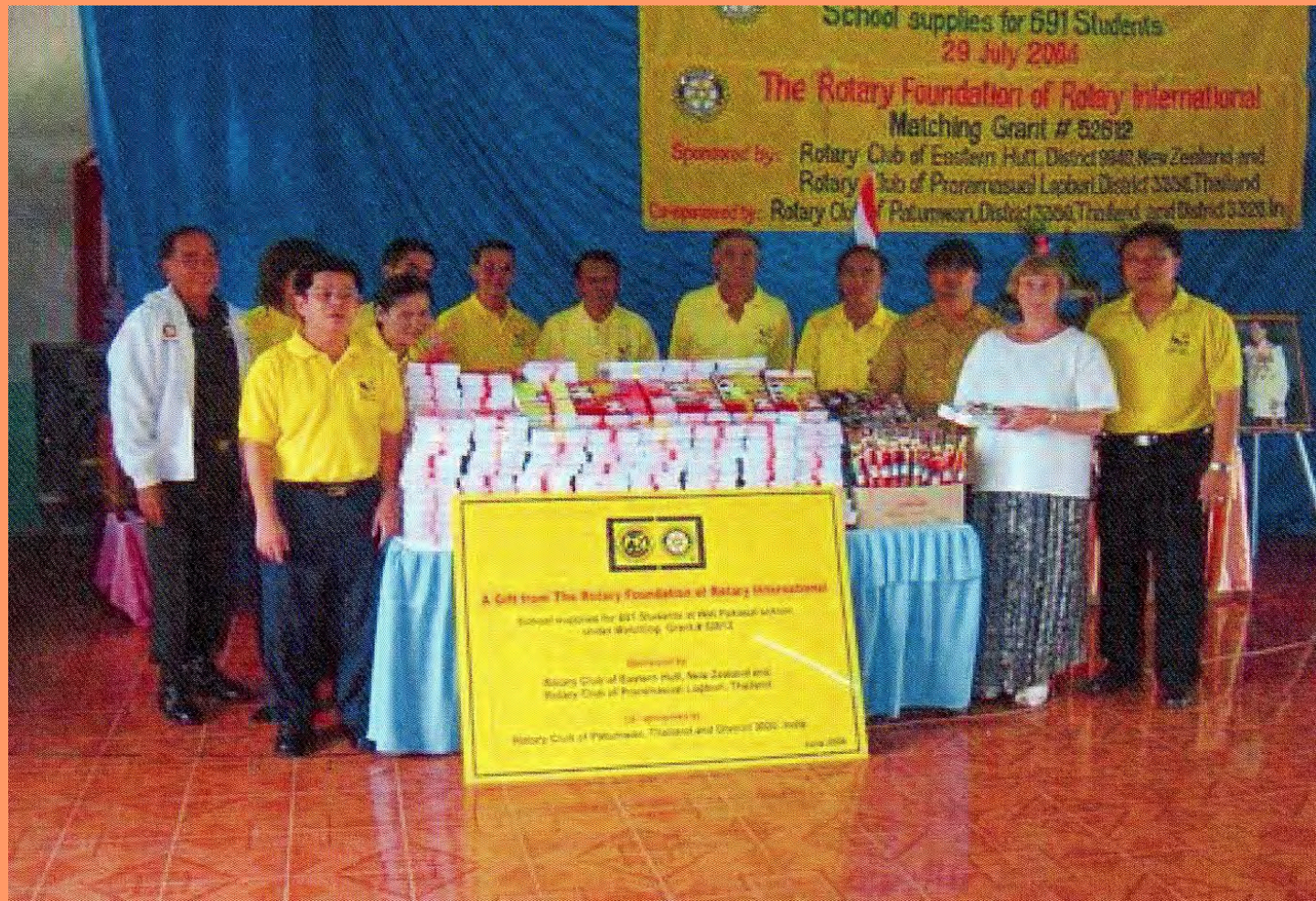
2004: basic school materials for children in Lopburi, Thailand (Anne Abbott)