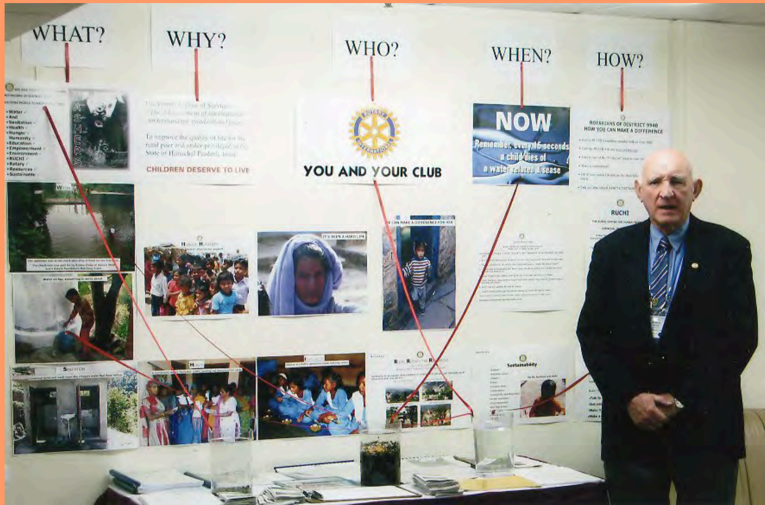
RUCHI Display at District Conference (Colin Alford)