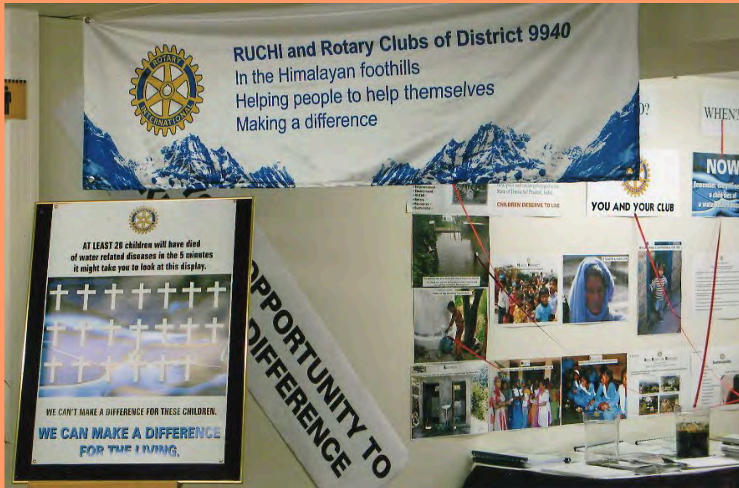
RUCHI Display at District Conference