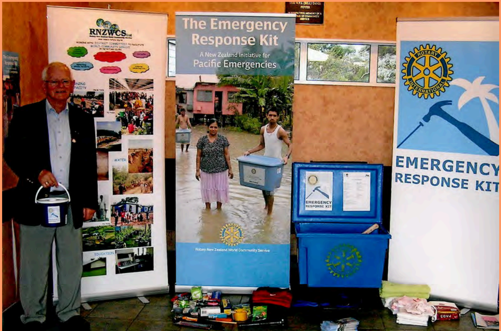
2011: Emergency Response Kits at District Conference