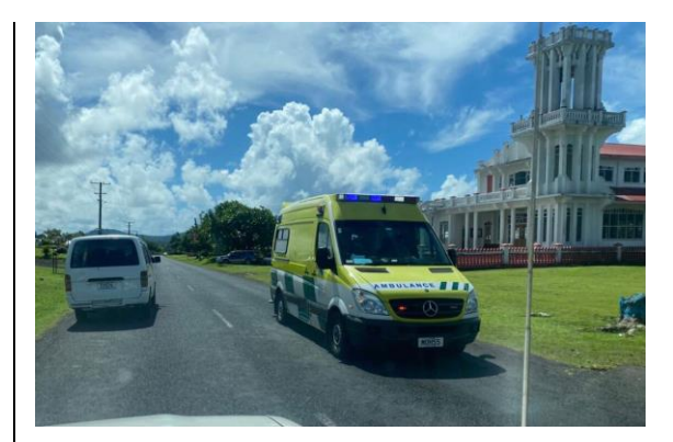
This Rotary sponsored ambulance Spotted on the Samoa's Island of Savaii in early May.

Ambulances are often requested by Health Depts. in Pacific countries. Donations by Rotary Clubs across New Zealand resulted in ambulances being more recently sent to Tonga and Samoa. Samoa's vulnerability became all too apparent during the 2019 Measles Epidemic when they were insufficient vehicles available. An addition to their fleet was sent in 2020 and a further vehicle will be sent in the coming months. The two ambulance providers in New Zealand support Rotary allowing this to happen. Prior to shipping, the ambulances are thoroughly checked mechanically etc. and sign written to acknowledge the donors and incorporate the requirements of the country to which being sent. For clubs wishing to support this activity with likeminded clubs email info@rnzwcs.org for full details.