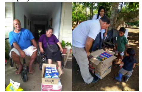
Photographs published with permission

A project for Covid relief has been supported by clubs in New Zealand and USA in collaboration with Nuku'alofa Rotary. The staff of The Mango Tree Centre delivered food and essential supplies to most vulnerable disabled people under their care. 54 families in the first phase of the project followed by a second distribution of food and essential supplies to 40 families. The staff also arranged for the repair of water systems for 5 families damaged by cyclone. Two computers for use in training staff at the Mango Tree Centre were also purchased as part of the project.