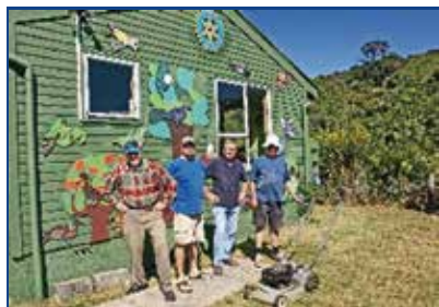
Working bee at the Discovery Area.