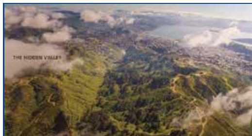
The 'hidden valley', future site of Zealandia.

This fence post initiative raised nearly $300,000.