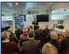
Race Relations Commissioner, Meng Foon, speaking at a breakfast meeting in 2020.