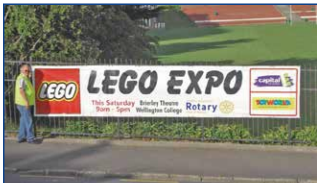
Expo, Wellington College, 2014.