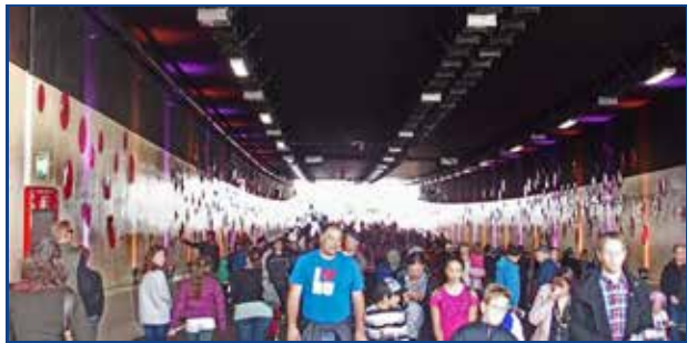
Huge crowds walk the completed tunnel.

In 2013 and 2014, our Club organised pre-opening tours of the Arras tunnel, adjacent to the Carillon and National War Memorial. The funds raised through gold coin donations went towards the Phillipines Disaster Relief Fund, set up following the devastation caused by the super typhoon Haiyan.