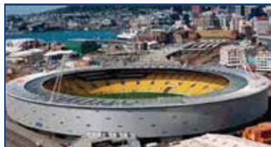
Wespac (now Sky) stadium

In 1999, our Club, with the support of the Rotary Club of Wellington and the Wellington City Council, organised hugely popular public pre-opening tours of the new Wellington stadium, prior to its official opening in January 2000.