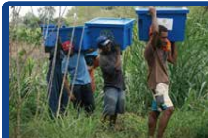
Our Club has regularly contributed to Rotary New Zealand's "ShelterBox" and emergency response kit programmes.