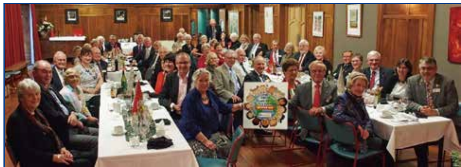
The Karori Club joins "The World's Greatest Meal", a worldwide Rotary initiative to raise funds to eradicate Polio, in 2012.