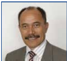
Governor-General-designate, Lieutenant General Sir Jerry Mateparae addressed the Club prior to being sworn in.

The Club meets every second and fourth Tuesday at Samuel Marsden Collegiate School (Marsden, to 'Karorians'). Most meetings feature a keynote speaker.