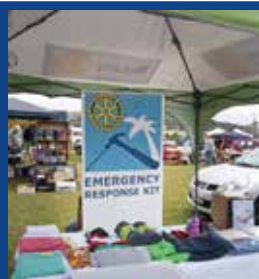
Fundraising for emergency response kits at the Karori Karnival, 2016.