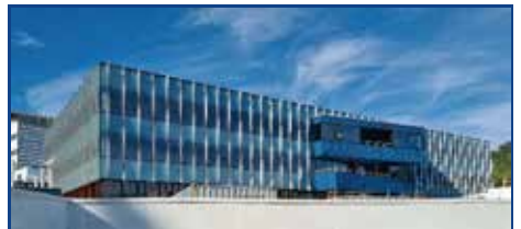
The new Wellington Regional Children's Hospital, scheduled to open in late 2022.