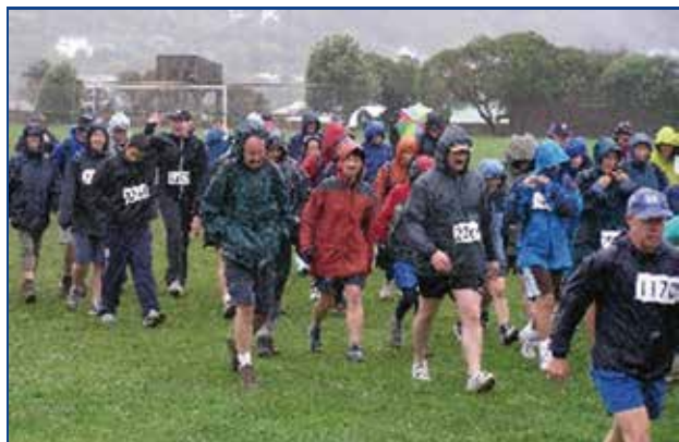
Gutbuster competitors leaving the start line at Ben Burn Park.

years. Many club members participated and others helped manage the event, both in planning and 'on the day'. These races also contributed funds for the development of an education centre for school groups.