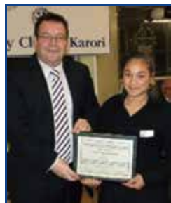
Wellington Central MP, Grant Robertson, with an award winner.

Public ceremonies are held to recognise recipients of the Karori Youth Awards each year. These are attended by community leaders, parents, other family members and friends.