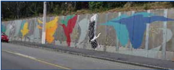
Karori Road mural on the wall outside Marsden School. Rotary Karori is one of several community organisations recognised for contributing to the cost of preparing this mural.