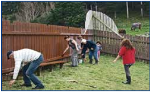
Working bee, Makara Model School, where we also made good use of 'redundant' office computers.

energies of all and, by lunch time, a long timber fence had been painted, trees trimmed, grass cut, and weeds removed.