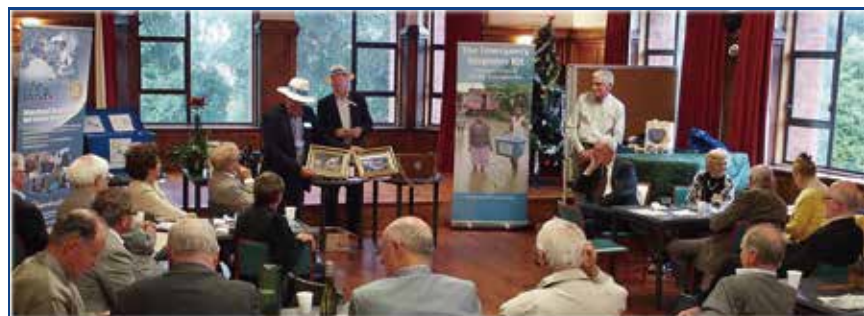
A later art auction in full swing at Marsden School, December 2014.

Throughout the '80s, the Club held a number of successful art auction fundraisers. The first, in 1983, and was held at Firth Hall, Wellington College. 120 people attended and the value of the paintings sold topped $5,600. This was followed in 1984 with an auction of art, pottery and sculptures at The Academy in Willis Street, which produced a profit of $2,500. Three further auctions were held, all at the Teachers' Training College in Karori. The first, in 1985, had