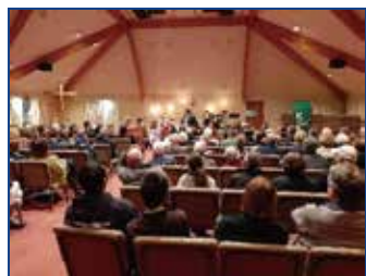
Wellington Central MP and deputy Prime Minister Hon. Grant Robertson speaking at a meeting at the Karori Baptist Church, one of the largest held in the Capital before the general election in 2020.

For many years, our Club, with the support of the Karori Residents' Association, has hosted public meetings in Karori before local body and general elections. These meetings have allowed residents to hear the views and policy positions of candidates standing for Parliament and for the Wellington City Council for our constituent area. This year, we will once again support the Karori Residents' Association at a public meeting in late August ahead of the City Council elections in October. And in 2023, we will no doubt be involved in organising public meetings for candidates in the next general election.