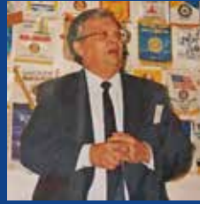
June 1993 and the Club is addressed by the Rt. Hon. David Lange.

Following the upgrade of Karori Park, in September 2007, the Club also provided two bench seats, on the perimeter of the park, for the convenience of those undertaking activities or watching sport.