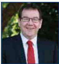
Deputy Prime Minister, the Hon. Grant Robertson addressed the breakfast meeting at Karori Park Café in March 2021 on a post-Covid world.