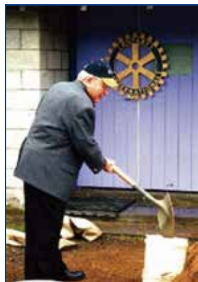
Visiting Rotary International President-Elect Glen Estess helping out on the Discovery Area construction in 2004.