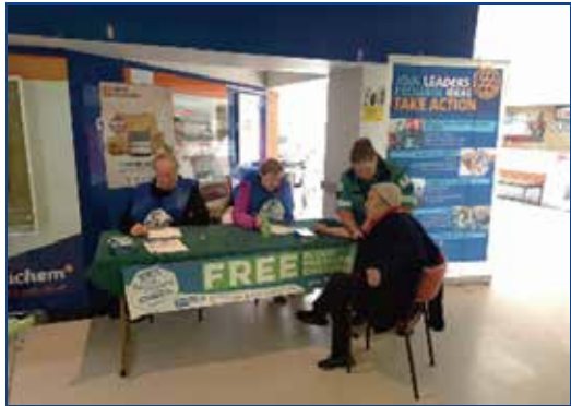
Blood pressure testing in full swing at Karori Mall.