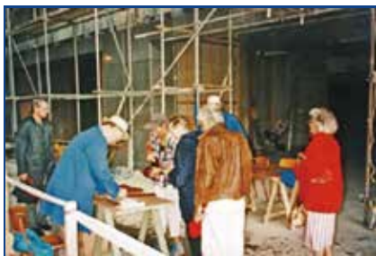
Visitors signing-in for pre-opening tours.

The Open Days commenced in 1996 and were repeated in 1997 and again, in 1998, once the building was finished. Over the three years, these tours raised $100,000 for a variety of very worthy causes.