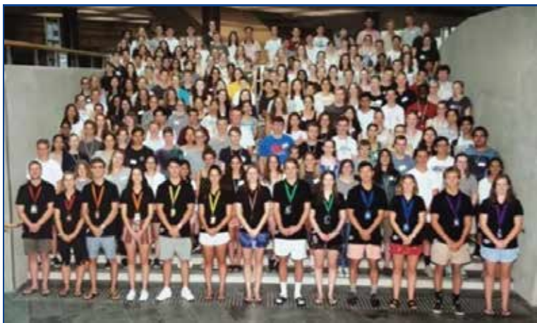
2018 Forum attendees from throughout New Zealand, including three from Marsden School.

Unfortunately, for the past two years, the programme has had to be cancelled due to the covid pandemic.