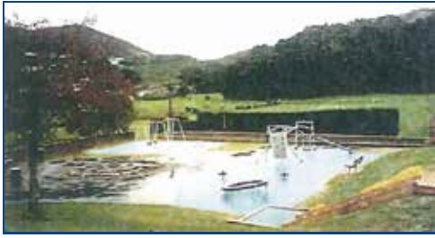
Karori Park Playground nearing completion.