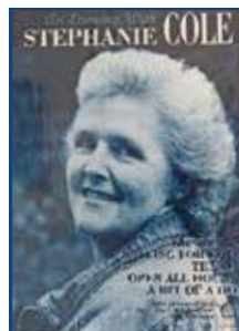
Programme for "An Evening with Stephanie Cole".