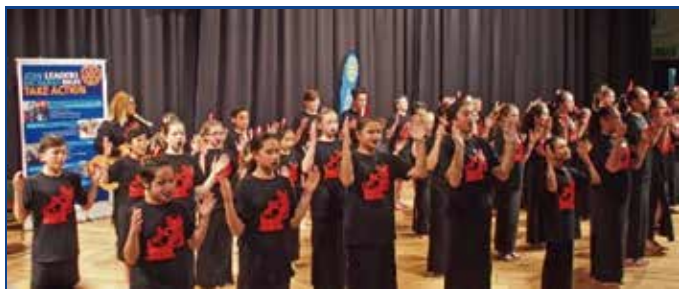
Students in the Kapa Haka group at Karori West Normal School perform at Award ceremonies.