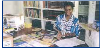
Unpacking library books in Kirakira.

In 2002, in response to an appeal from a Wellington VSA lawyer working in Kirakira, the provincial capital of the Makira-Ulawa Province in the Solomon Islands, the Rotary Club of Karori collected and despatched some 3,000 books to Honiara for subsequent distribution to the library in Kirakira and schools on Makira (also known as San Cristobal) Island.