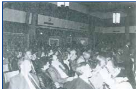
Large crowd at the art auction held at the Teachers' Training College in 1989.

225 attendees and art to the value of $14,525 was sold. The second, in 1989, produced a profit of $5,000. And the third, in 1990, a profit of $4,000.