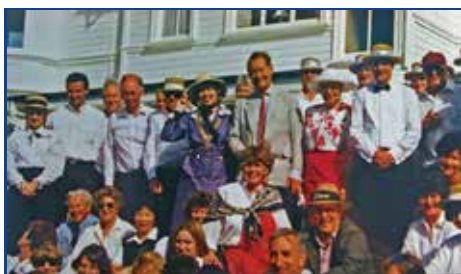
Homewood Garden Party, November 1997.