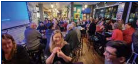
Quiz night fundraiser at One Fat Bird, June 2021.

As a result, our Club's district (which covers the Lower North Island with 1,500 members and over 50 clubs) pledged to raise $400,000, which will go towards developing and outfitting two family rooms, one on each of the inpatient floors. These rooms will