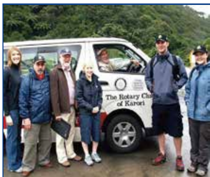
Karori Rotarians at the launch of the Karori community bus.

Between 2000 and 2002, Karori Rotary provided $6,000 towards the purchase of a replacement bus, in addition to regular and ongoing donations towards running costs.