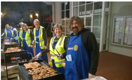
Cooking Breakfast at the Relay for Life