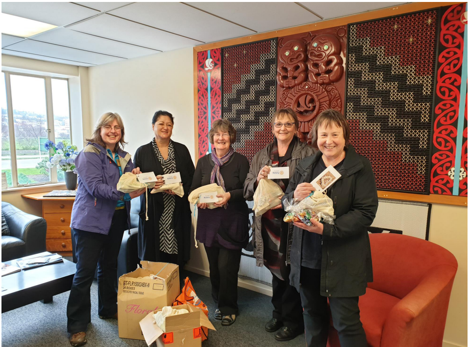
Care Packages for Te Whare Pounamu Womens Refuge Dunedin