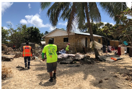
Rotary International Projects