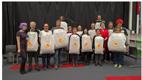
Mad Hatters Tea Party District 9980 Conference