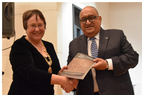
Rotary Dunedin Centenary Dinner 2023