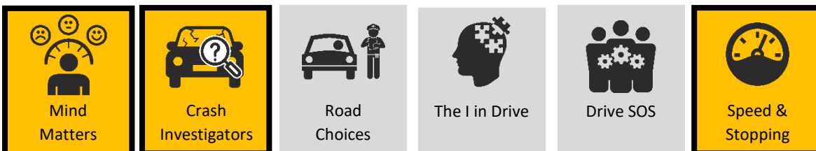
*Indicating Dunedin students top rated workshop sessions align with the nation

In another survey students were asked which of the six workshop sessions impacted them the most and the reason for this decision. The top three rated by students across New Zealand are highlighted with a black border, the top three rated by Dunedin 2026 students are highlighted yellow. We've picked out a few entries from student feedback below: