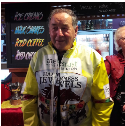
Lex proudly wearing their Harness Jewels jacket won in Ashburton by 2yr old 'One Over Da Moon'