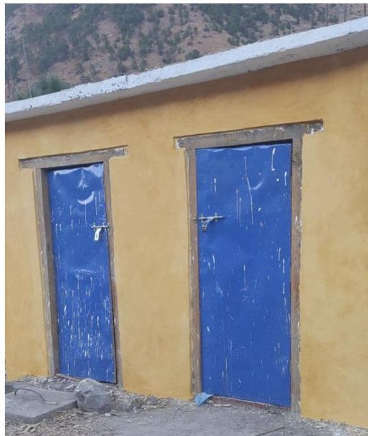
Final Toilet block