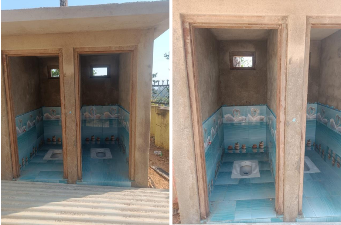
The plastering work is in progress and tiles in the toilet (indoor) have been installed.