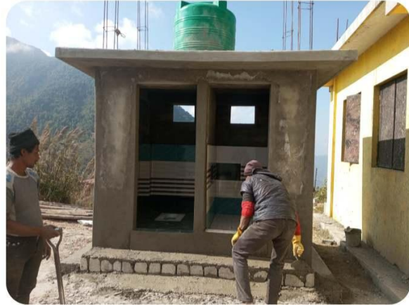
The tiles in the toilet (indoor) have been installed and plastering work is in progress.