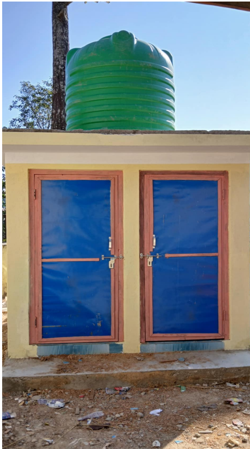
Final Toilet block at Kalika Secondary School.