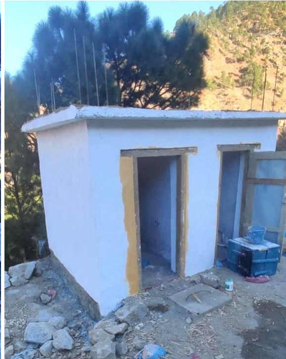
Painting work on the toilet block is in progress