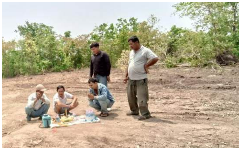
Small traditional ceremony for the site and building process