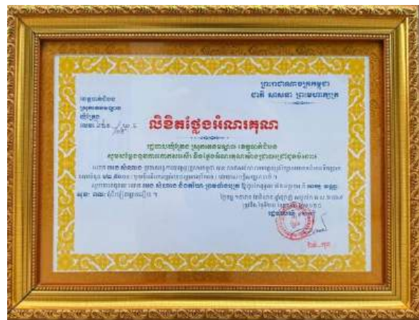
The District Governor delivered an appreciation letter to CFS.