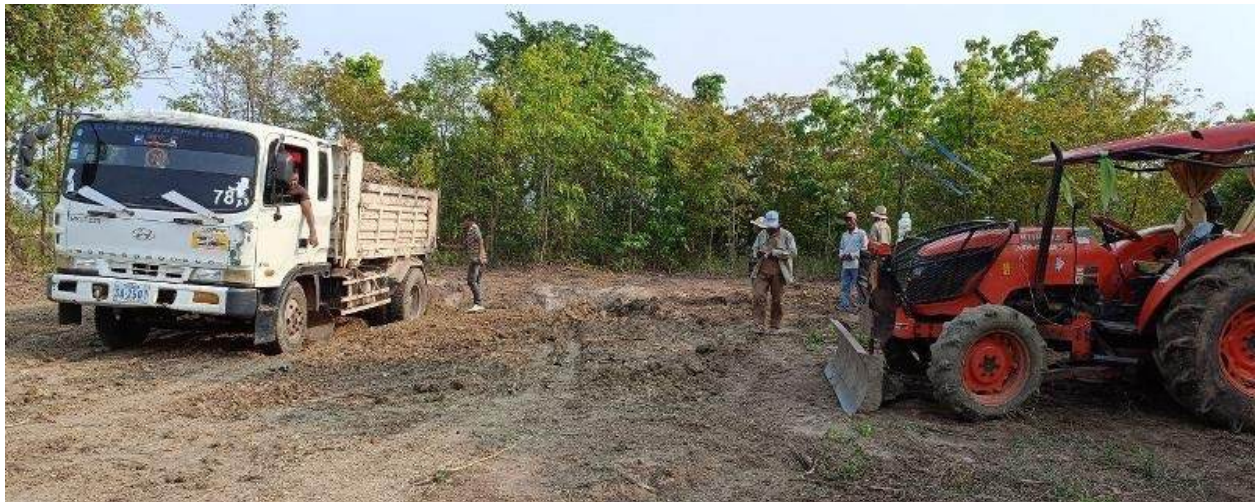
Gully is filled, site ready for building