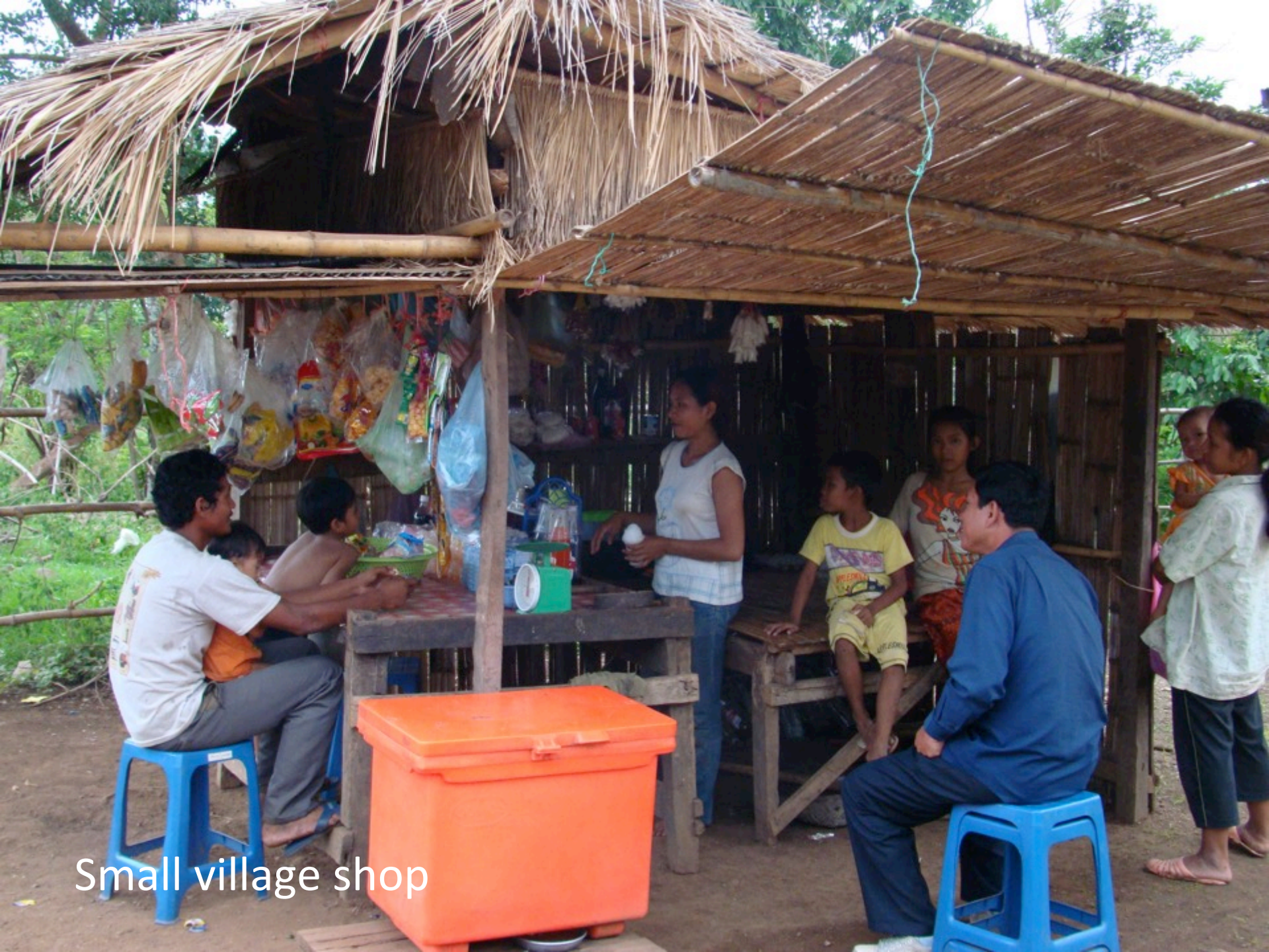
Small village shop