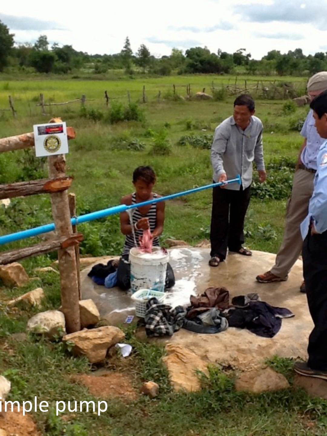
Pond and simple pump