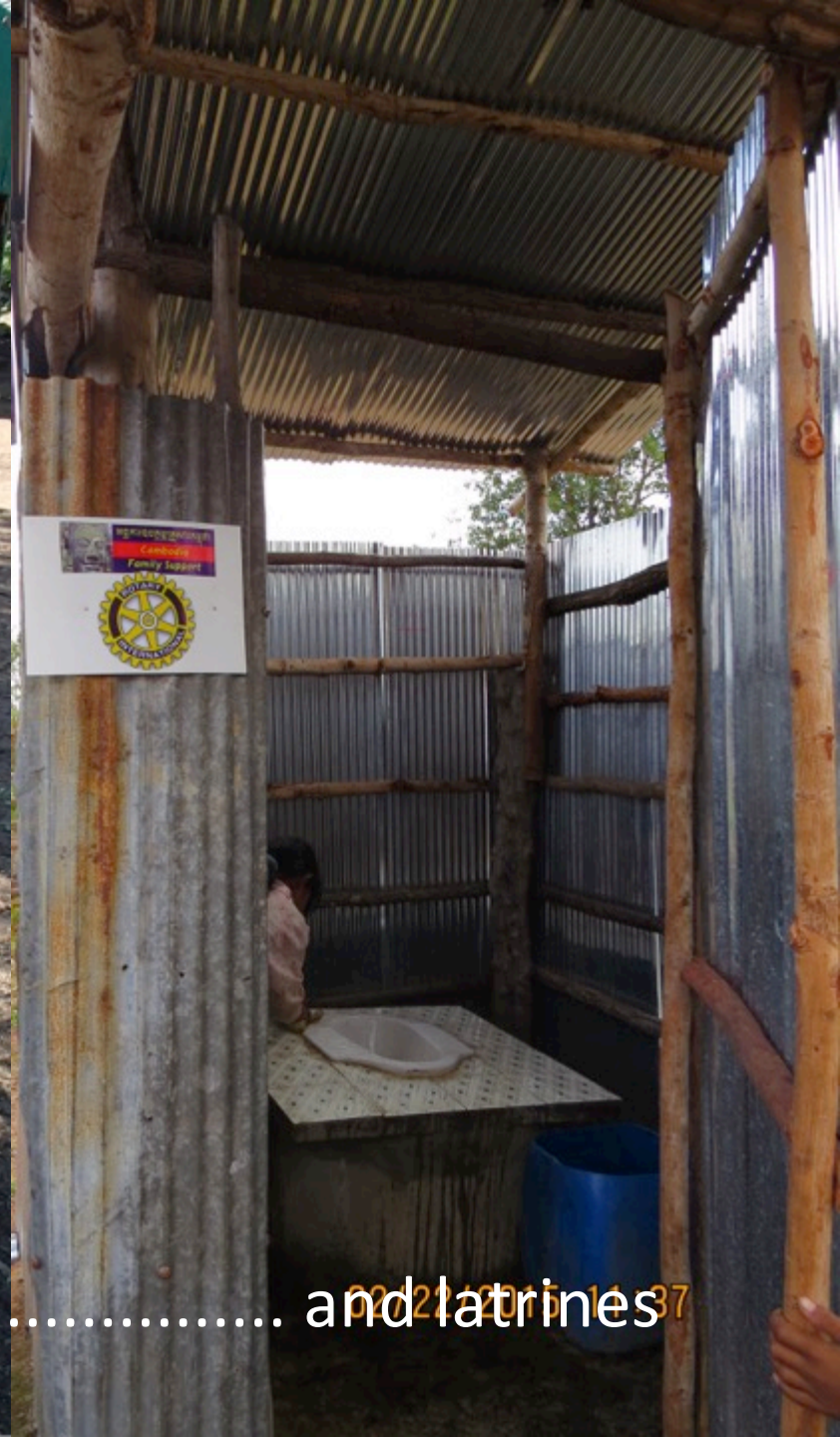
Wells ..... and latrines