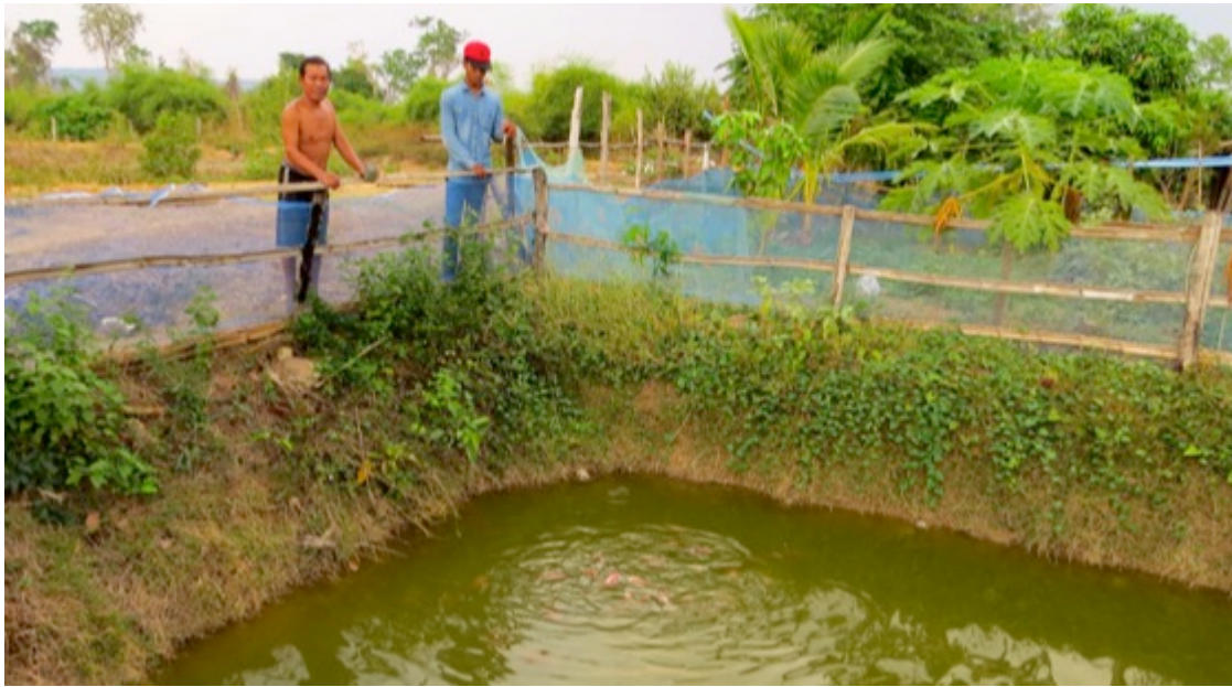
Pond for raising fish