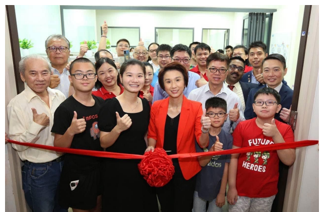
At the Opening Ceremony

More of this event will be featured in the coming issue of the Crossroads.