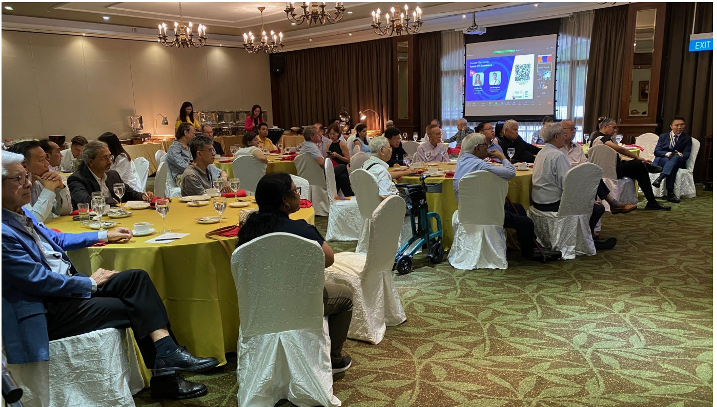
At the 1 st lunch meeting for Rotary year 2023-2024

13th Club Meeting for Rotary Year 2023-20234 held on 18.10.2023.