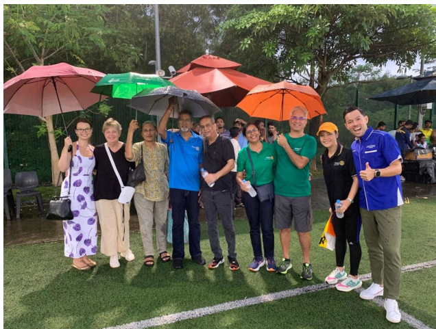
Even in the rain, there are always sunny smiles from Rotarians & friends