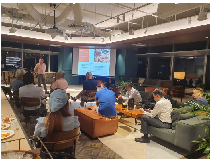
VSC meeting in progress

The AOTY team has started looking for nominations for this year's award, and an official request will be circulated to RCS members soon. Any inputs from members are very welcome.