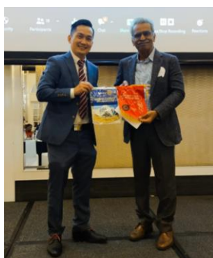
Banners exchanged with RC Delhi South