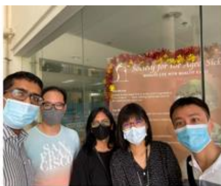
Visit to the Society for the Aged Sick also on 16 July 2022