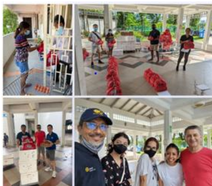
Distribution of food packages to the Food From The Heart beneficiaries on 16 July 2022