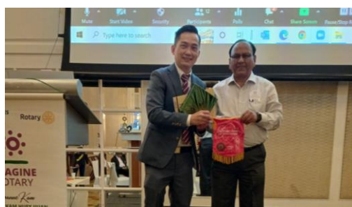
And with RC Calcutta Acropolis