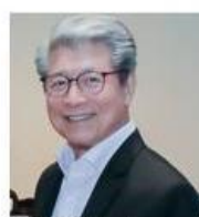
PP Stan Low PHF+3 pin