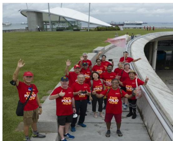
End Polio Now Walk – 21 August 2022