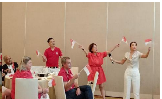
Enjoying a great Sing-along