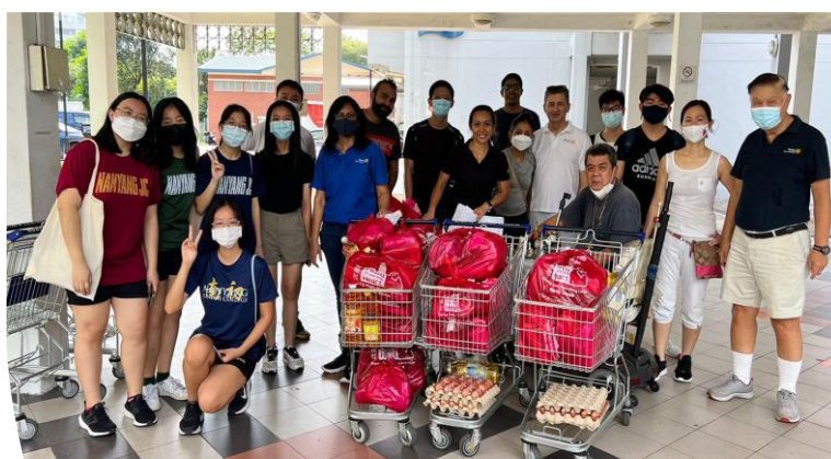
Food From The Heart – 20 August 2022