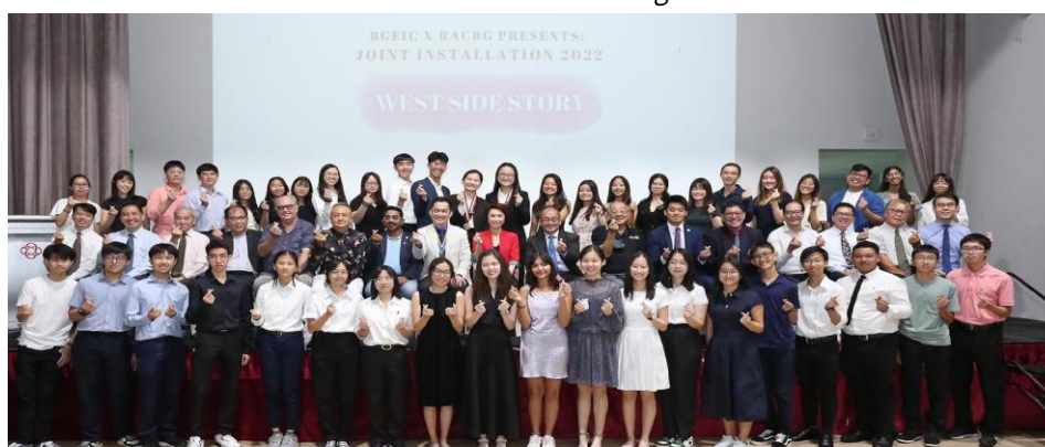
Installation of Bukit Gombak Interact and Rotaract Clubs – 20 August 2022