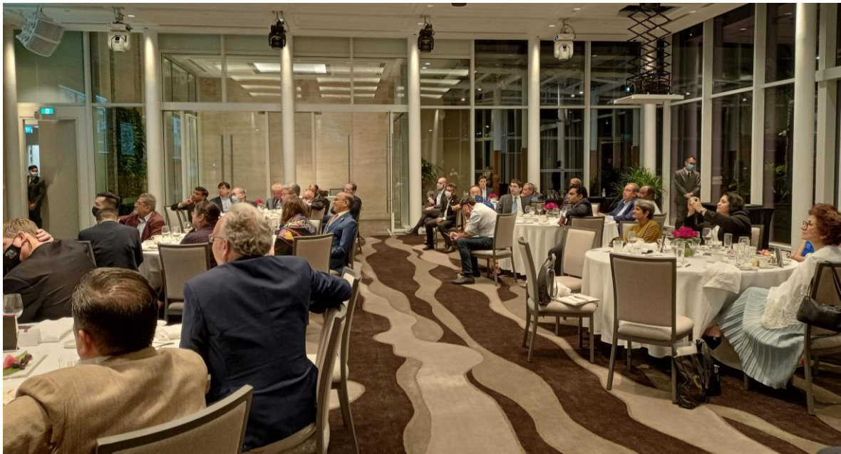
A full house at the Club's 2 nd physical meeting on 31 March 2021 at The Pavilion, Conrad Centennial Singapore