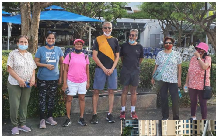
22 Rotarians and their families, (in groups of 8) enjoyed a walk along the Kallang River on a lovely Sunday morning