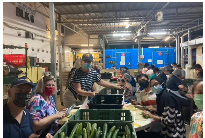
The Rotary team preparing the vegetable for the Willing Hearts' Soup Kitchen