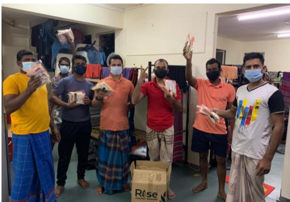
Migrant workers receiving the packets of rice