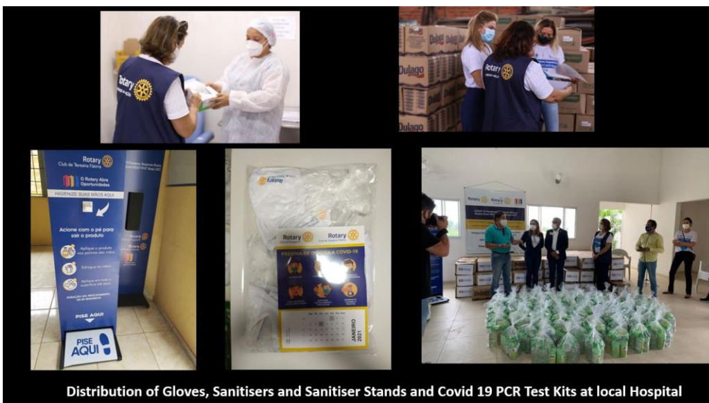
Distribution of Gloves, Sanitisers and Sanitiser Stands and Covid 19 PCR Test Kits at local Hospital