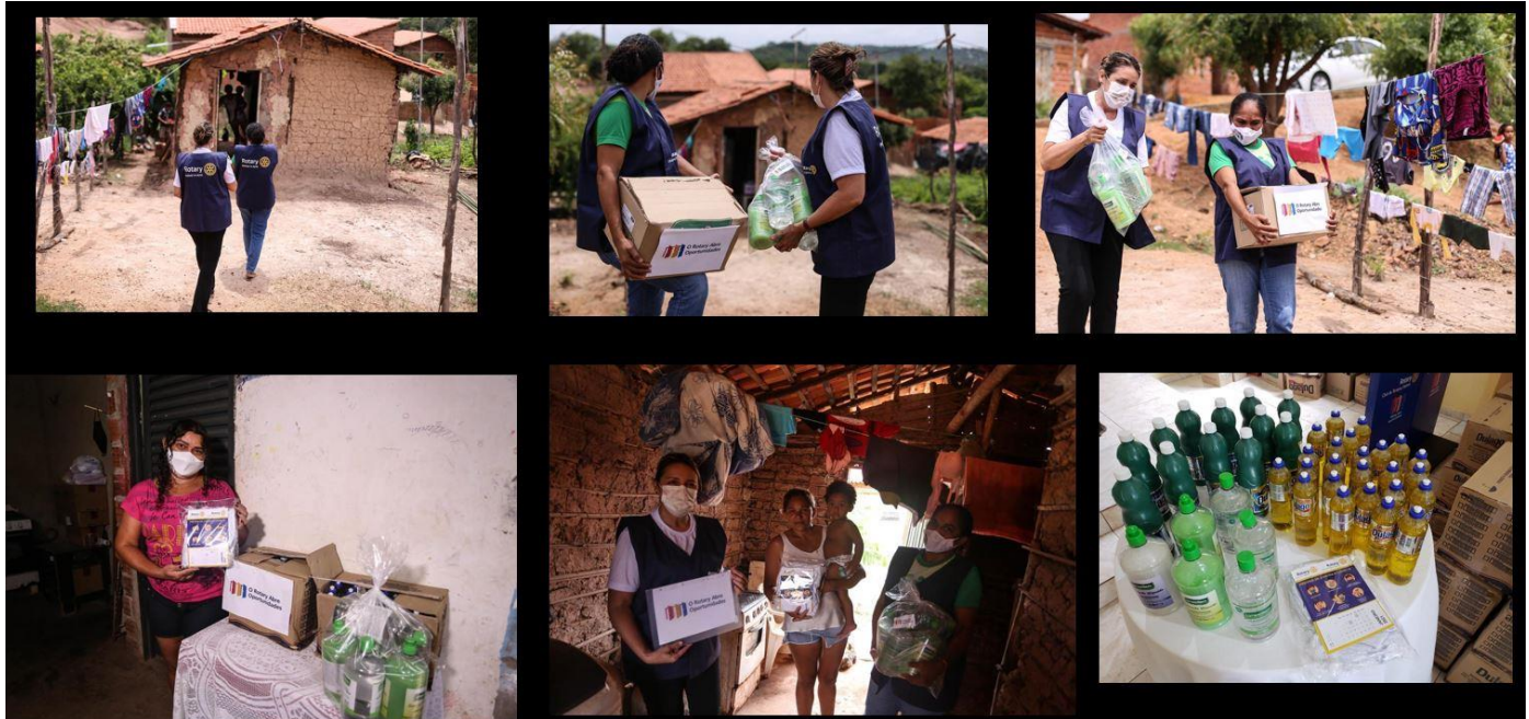
Distribution of Masks, Hand Sanitisers, Liquid Soap and Cleaning Agents to Homes in Porto Centro Village in Piaui, Brazil. These were distributed to 350 Families benefitting 1750 people in the area.