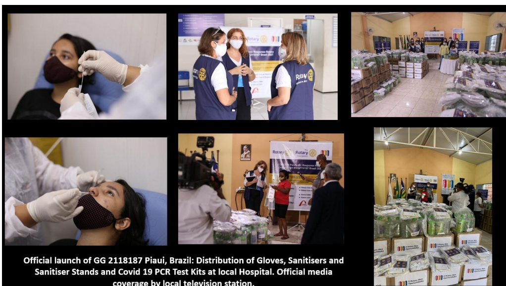
Official launch of GG 211817 Piauí, Brazil: Distribution of Gloves, Sanitisers and Sanitiser Stands and Covid 19 PCR Test Kits at local Hospital. Official media coverage by local television station.