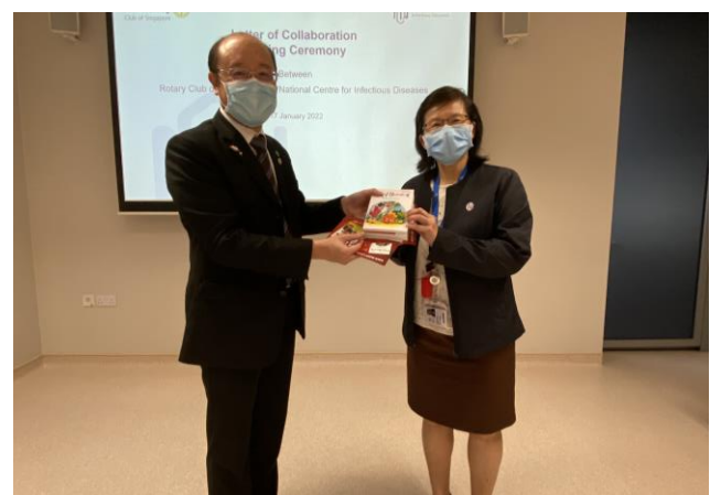
Exchange of gifts between NCID and RCS