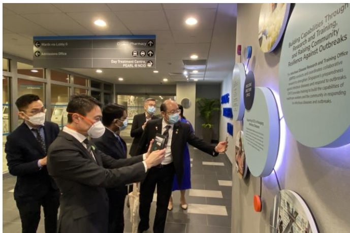
Members touring the NCID facilities

Following are photographs taken during the Letter of Collaboration signing ceremony.