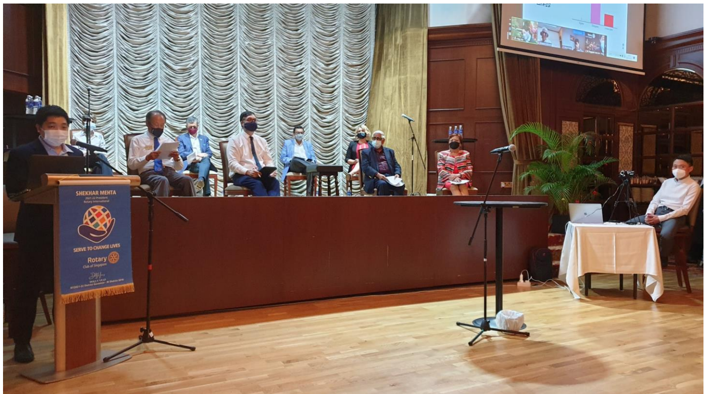
At the start of the Debate