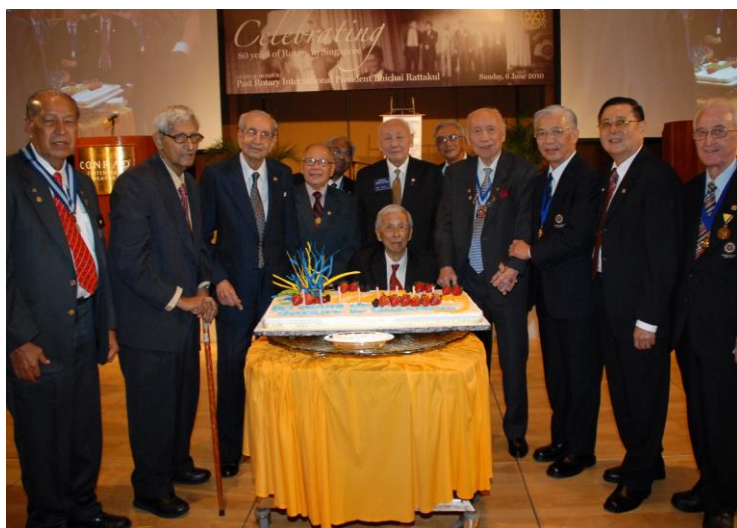
80 years of Rotary celebrations – cake cutting by those born before our Club was formed i.e. equal or older than 80 years