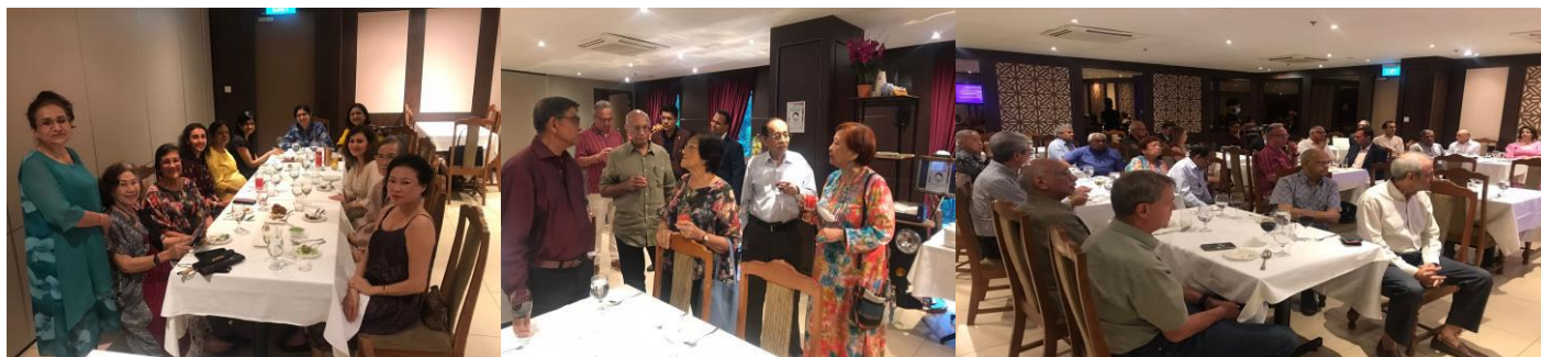
At the International Service Committee meeting on 15.9.22