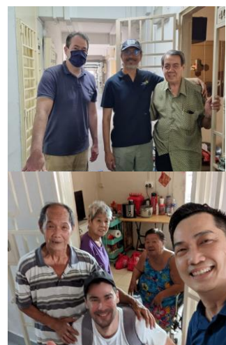
Food From The Heart Distribution on 17.9.22