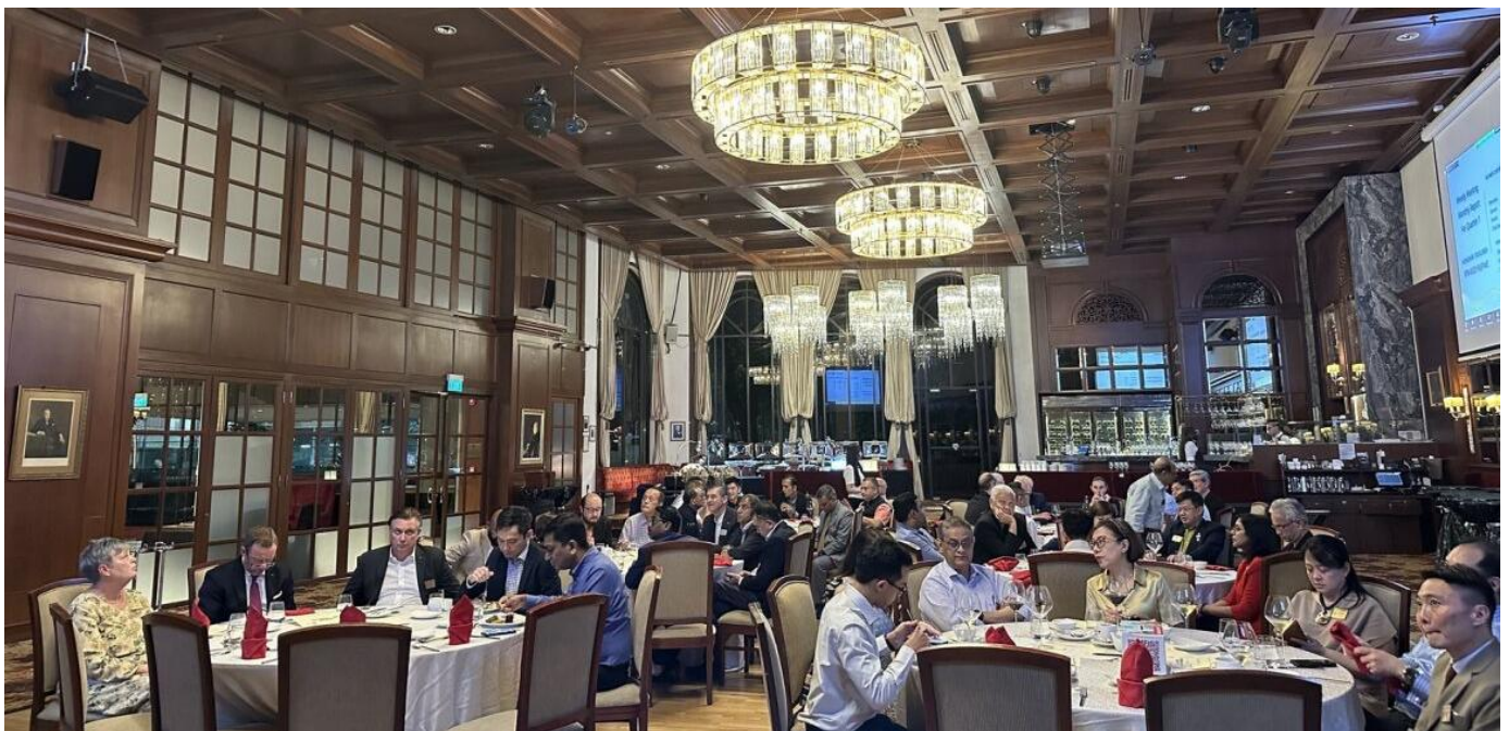
Members at the EGM & 2 nd Club Assembly held at the Churchill Room, Tanglin Club on 4.10.23