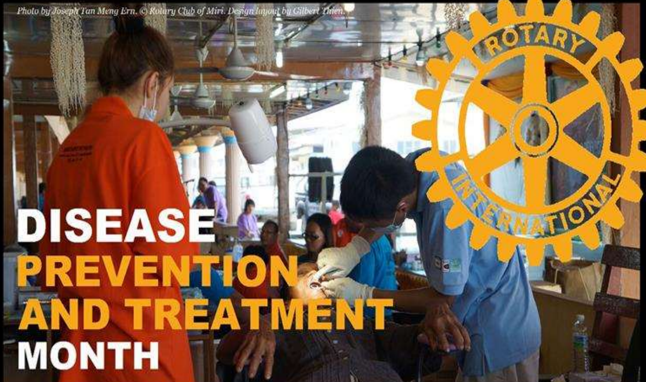
Design layout by Gilbert Limen.