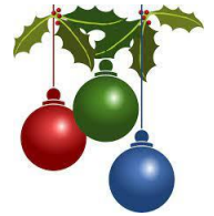
Photo Album of Christmas Fellowship on 15.12.23...