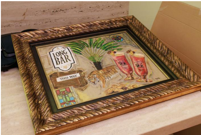
A Dutch Auction was held for the painting donated by Rtn Terry Lobaton. Total raised was S$5,288.00