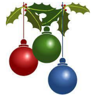
Photo Album of Christmas Fellowship on 15.12.23...