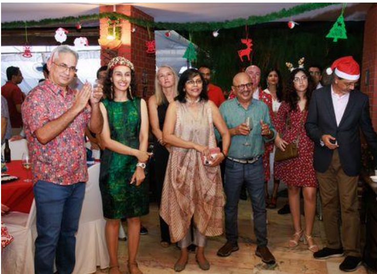
An appreciative audience