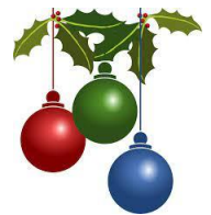
Photo Album of Christmas Fellowship on 15.12.23...