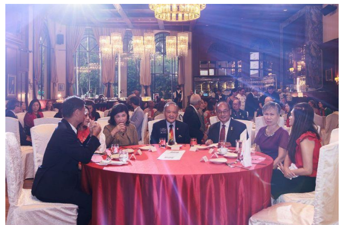
The VIP Table