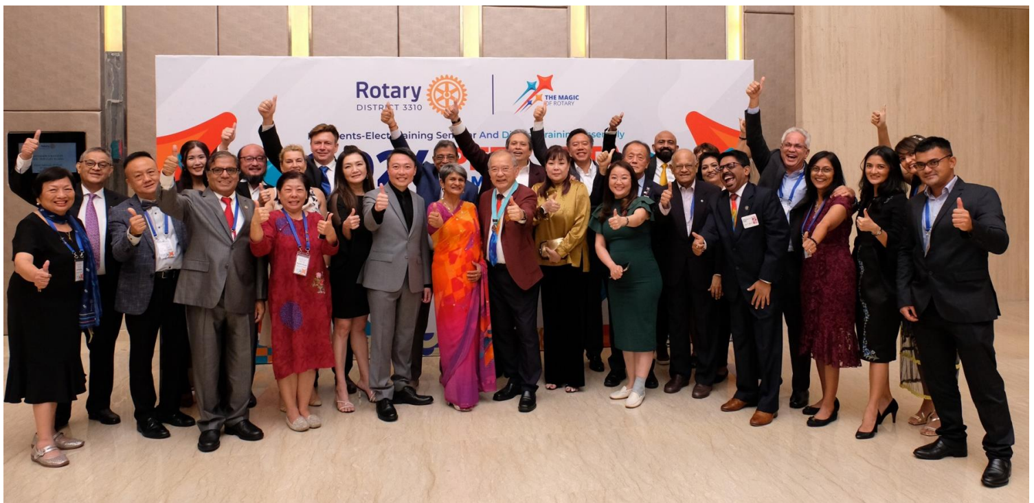
RCS delegation at the Governor's Banquet on 9.3.24

An e-bulletin published by Rotary Club of Singapore