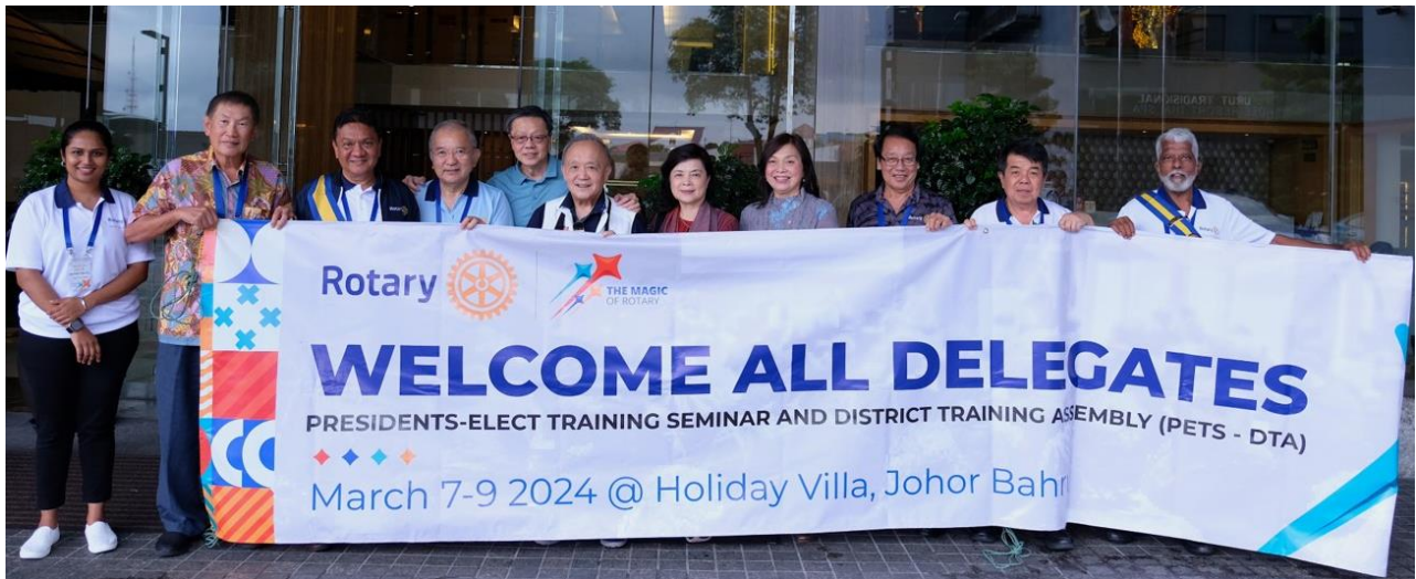
A warm welcome to all delegates to the PETS & DTA