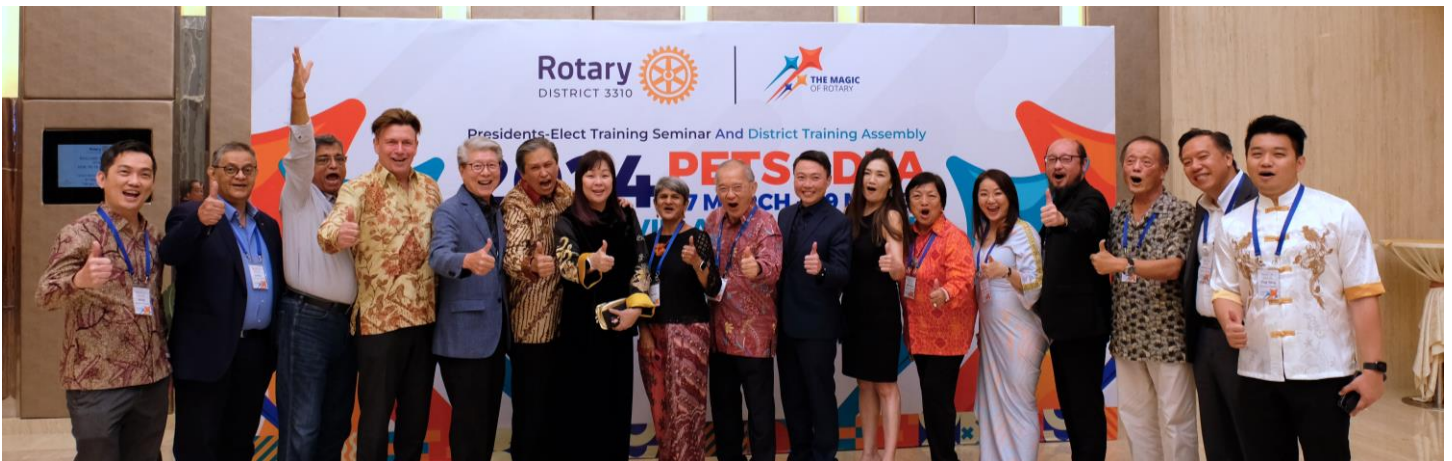
Rotary Club of Singapore's delegates