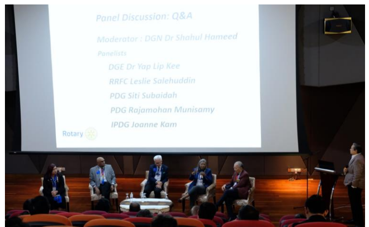
Panel discussion at PETS/DTA