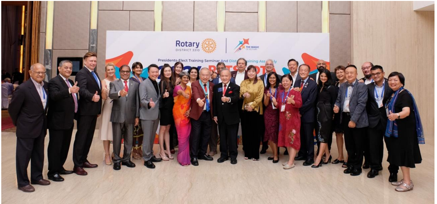
Rotary Club of Singapore (RCS) delegation with PRIP Gary Huang (centre)