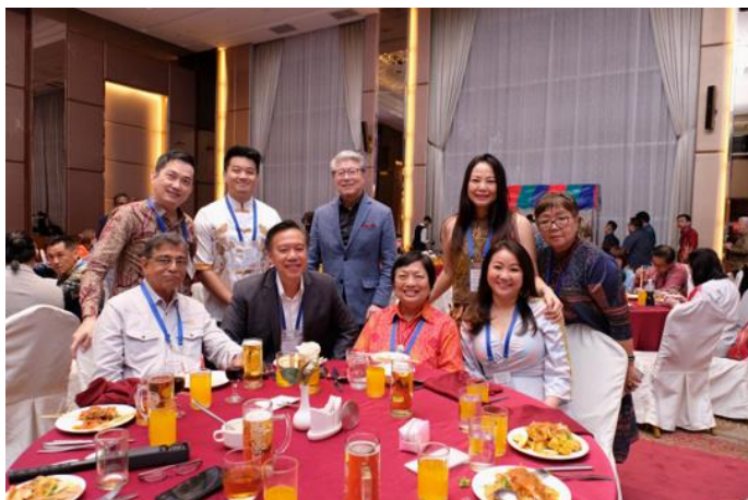
Fellowship at the Welcome Dinner