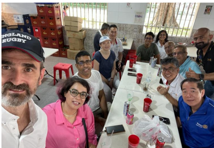
Enjoying a cold drink and warm fellowship