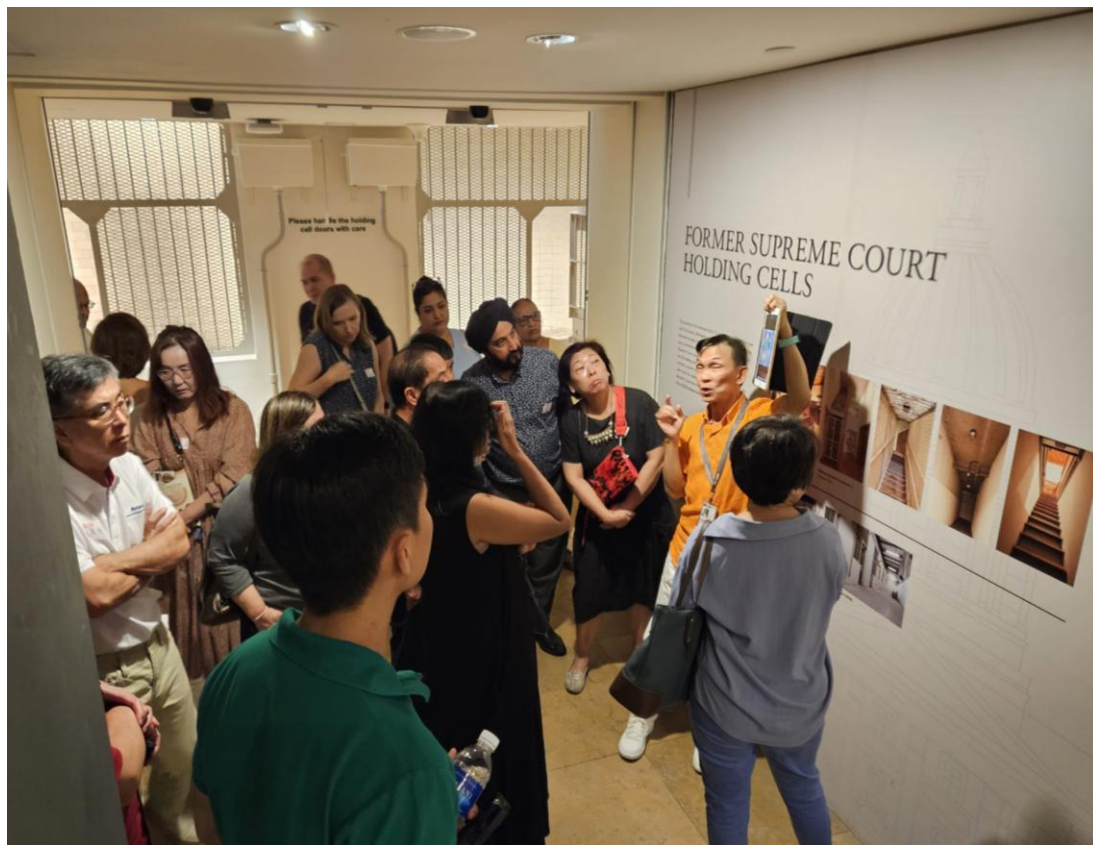
Learning history of the former Supreme Court