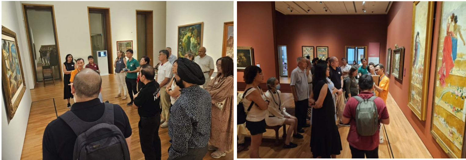
Viewing some of the 8,000 artworks