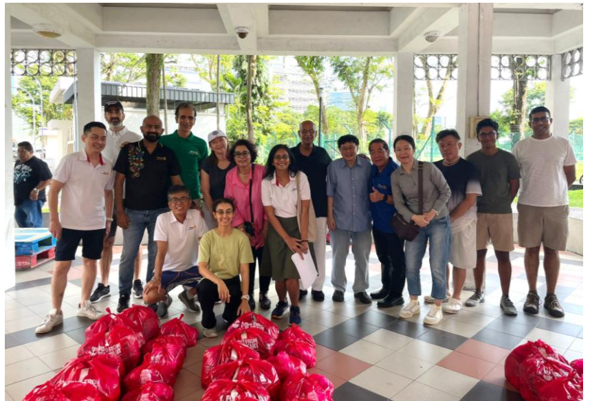
All set for the distribution