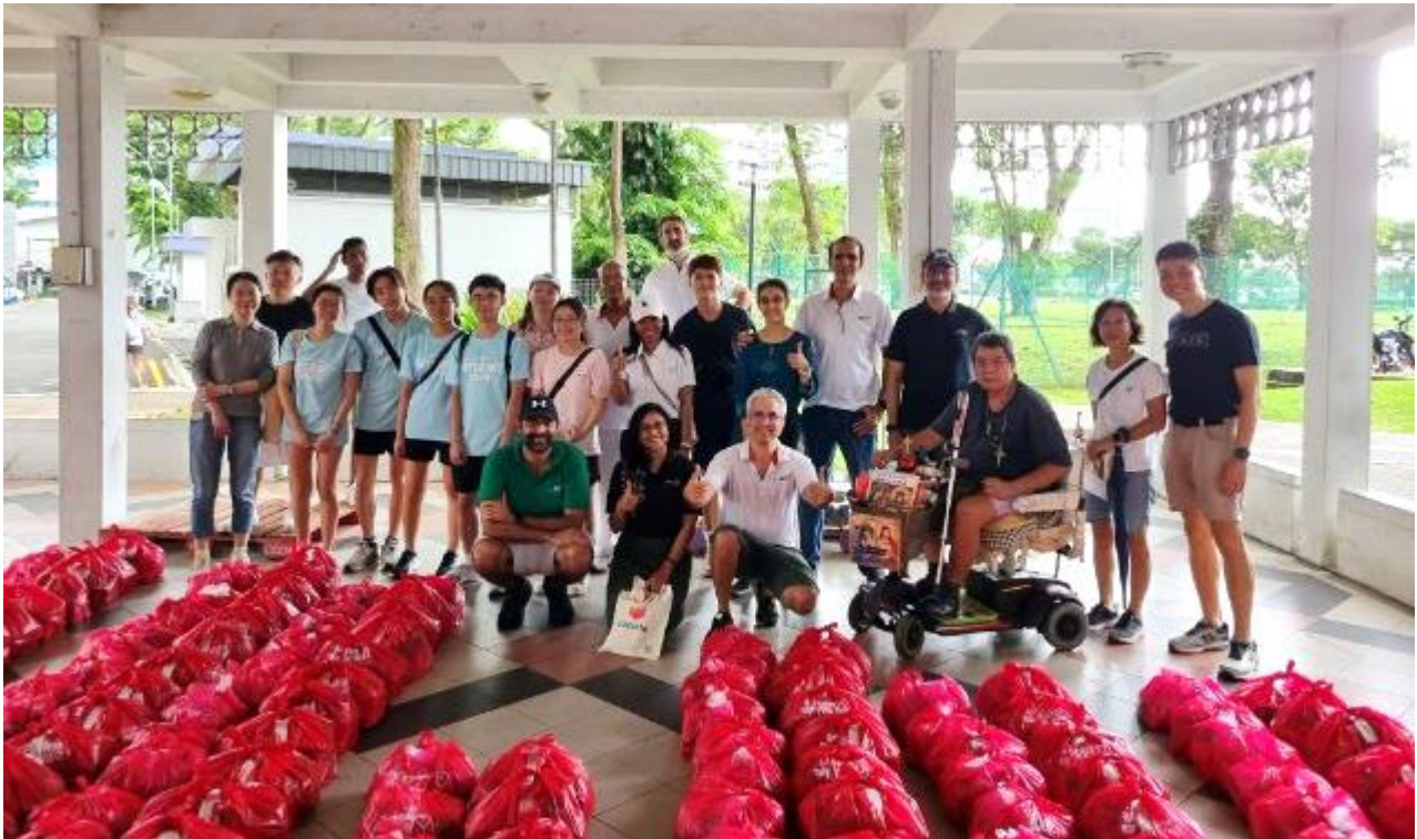
Food packages all packed and ready to go