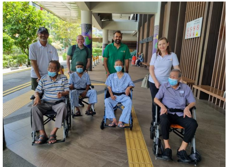
Members assisting the wheelchair bound Jamiyah Nursing Home residents