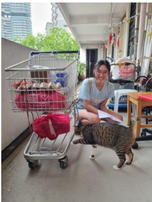
Our Interactor enjoying some feline company