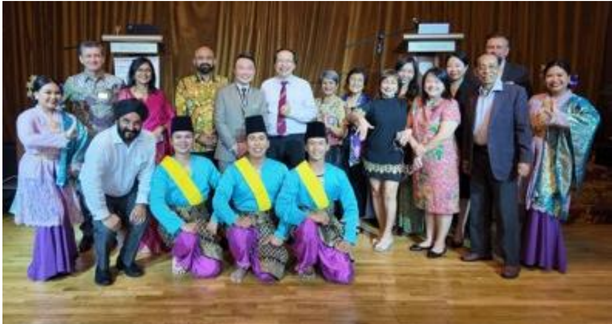
Members and guests posing with the Kirana Seni Malay traditional dance group

Photo Album of the Club's Hari Raya Celebrations: