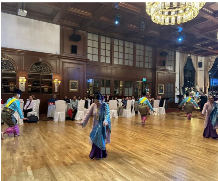
Enjoying the dance performance