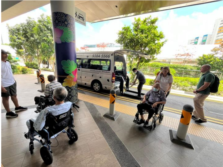
Photo Album of Hari Raya Celebration with Jamiyah Nursing Home Residents... contd