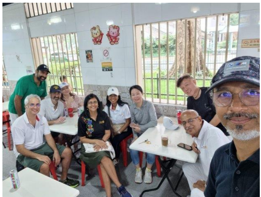
All smiles after a wonderful day of volunteering