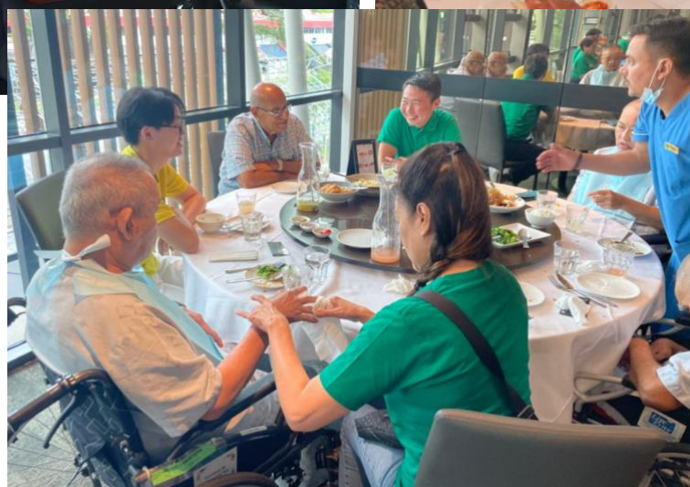
Sharing a wonderful meal & heartfelt conversations

An e-bulletin published by Rotary Club of Singapore