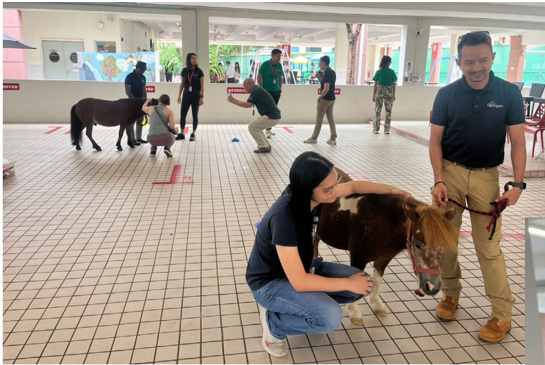
Rotarians and their families interacting with the special ponies from Equal Ark