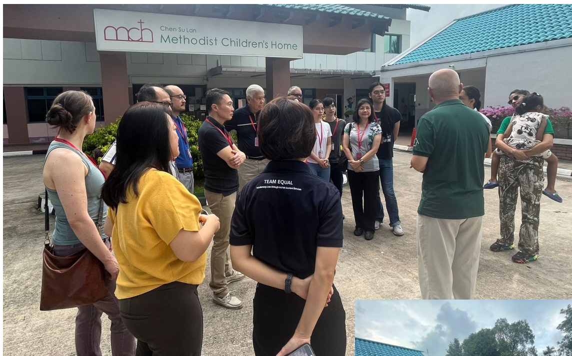
Briefing on the Chen Su Lan Methodist Children's Home activities and about the Equine-Assisted Learning Programme