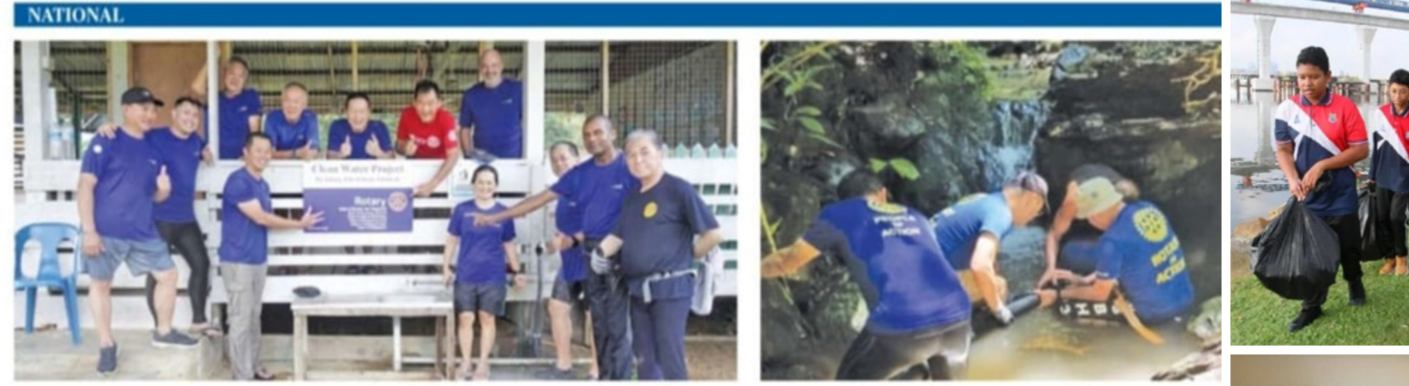
FROM LEFT: The Rotary Club of Bandar Seri Begawan members in a group photo; and during the project.