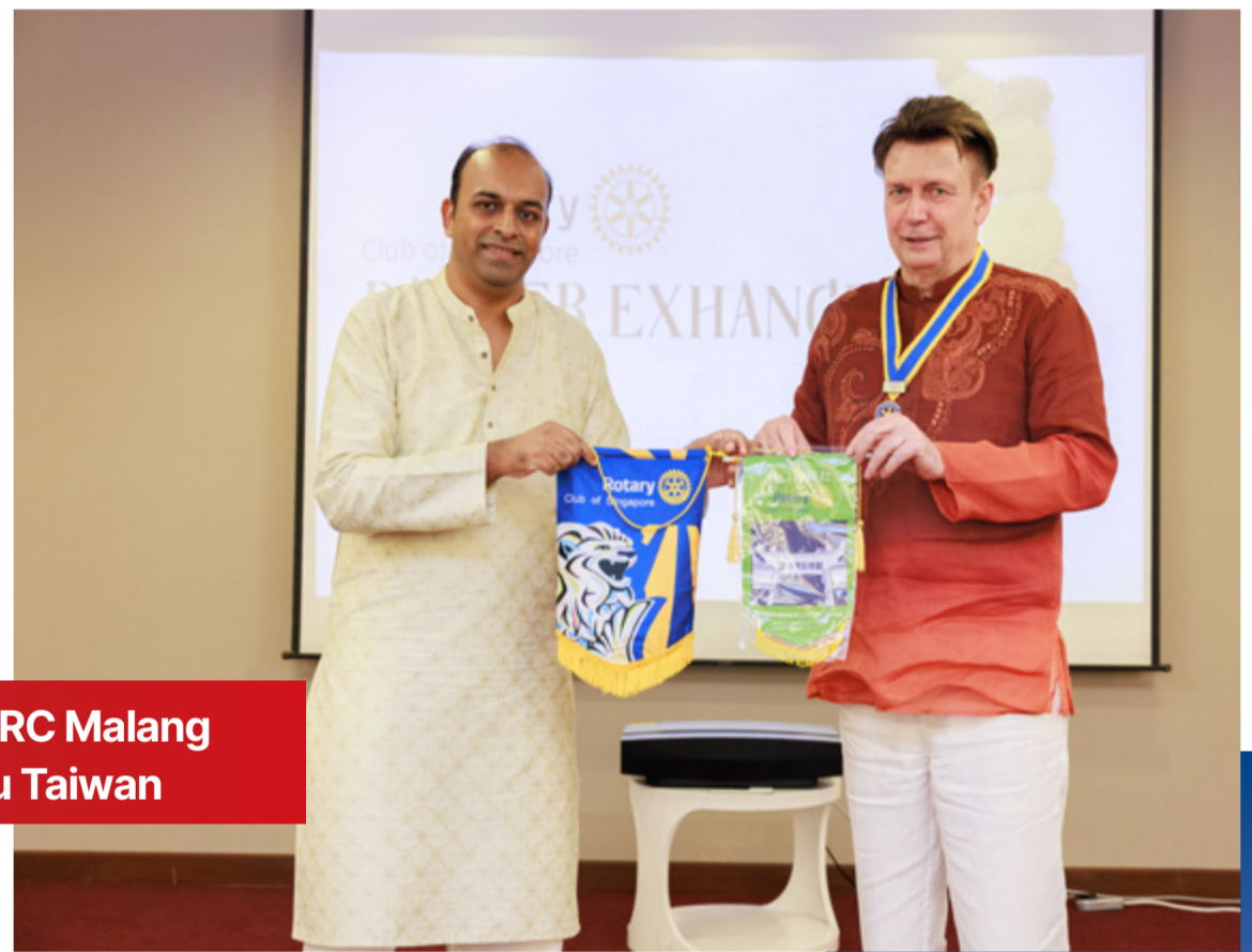
ISC Director on behalf of RC Malang Central and RC Linkou Taiwan