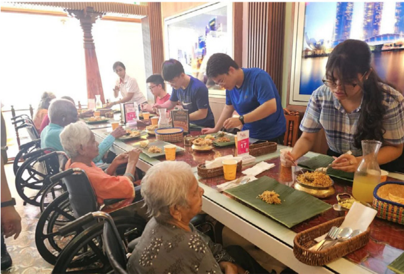
லிட்டில் இந்தியா ஆர்க்கெட்டிலுள்ள 'பனானா லீஃப் அப்போல்லோ' உணவகக் கிளையில் முதியோருக்கு வாழையிலை விருந்துணவைப் பரிமாறும் இளையர்கள்.