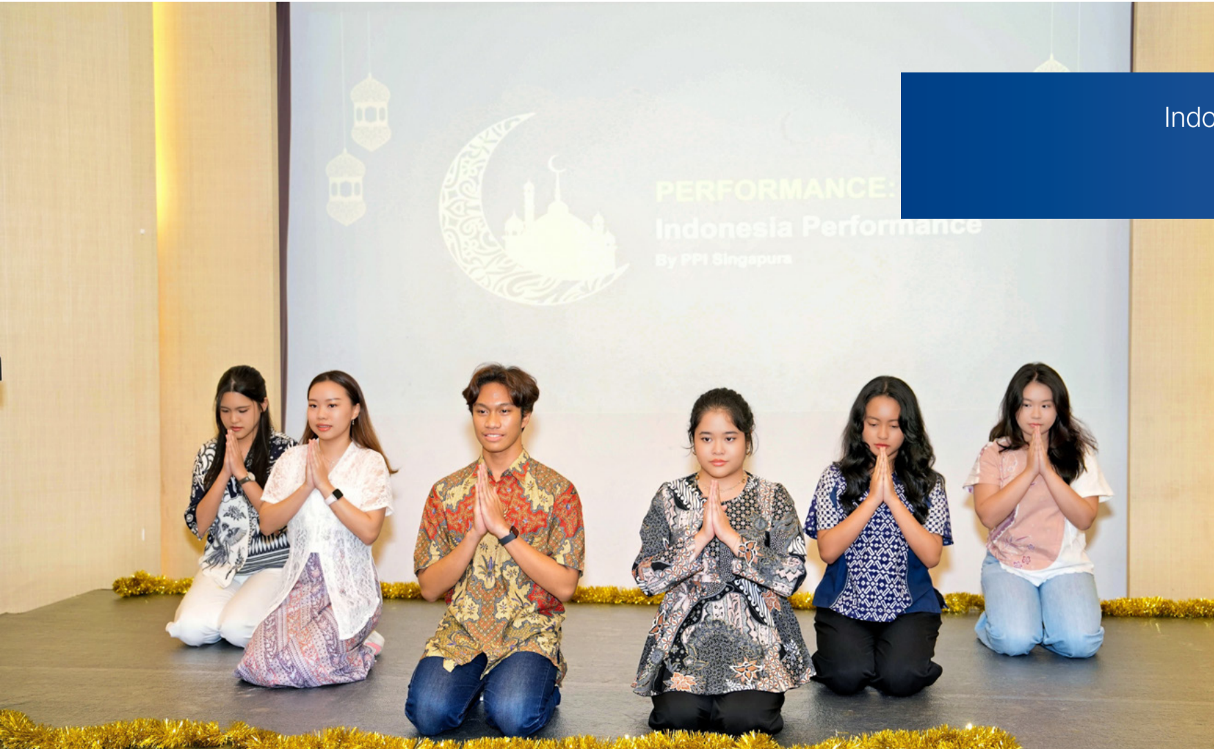
Indonesian Dance Performance by PPI Singapore