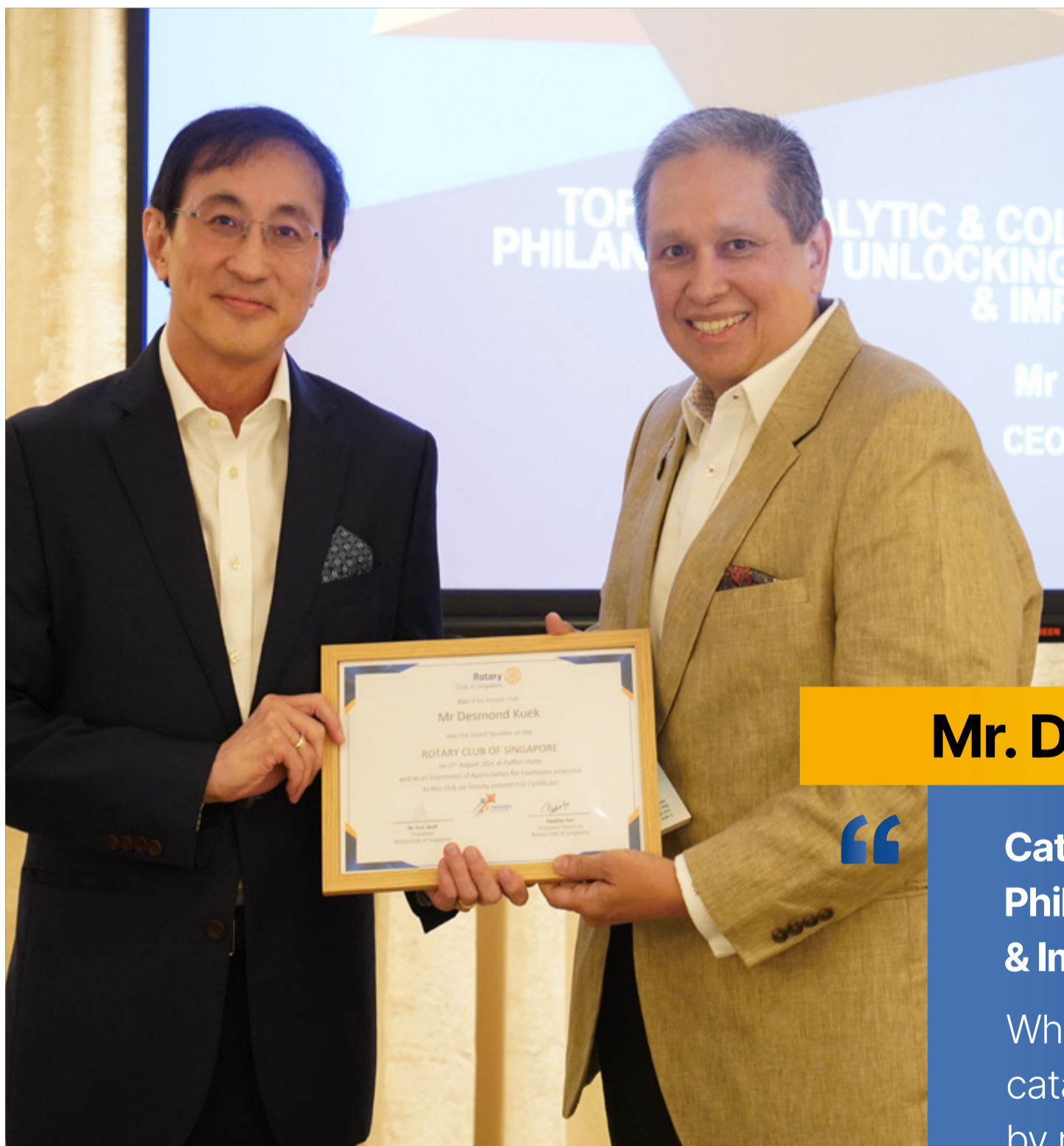
CEO of Temasek Trust