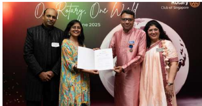
Sister Club Agreement with RC Belur

Rotary Club of Singapore formalized its sister club relationships with Rotary Club of Belur, Rotary Club of Surabaya, Rotary Club of Taipei, and Rotary Club of Muar through official signing ceremonies. Banner exchanges were also carried out with each of these clubs as a symbol of our enduring partnership and shared commitment to service.