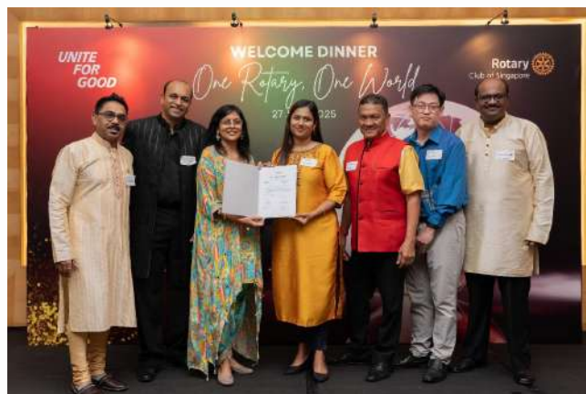
Sister Club Agreement with RC Muar