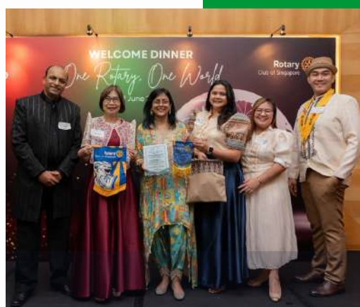
Banner Exchange with RC Marbel