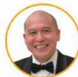
VJ Africa Public Image & PR Director