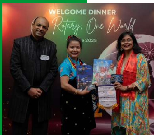
RC Bagmathi, Kathmandu, Nepal