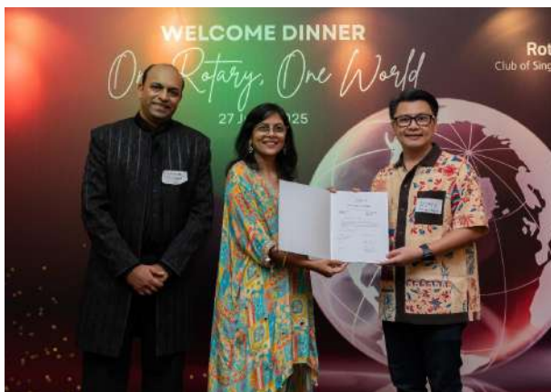
Sister Club Agreement with RC Surabaya