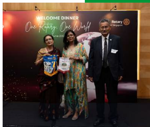
Banner Exchange with RC Chandragiri, Nepal