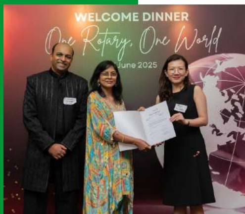
Sister Club Agreement with RC Taipei