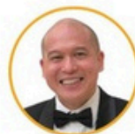
VJ Africa Public Image & PR Director