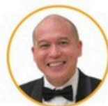
VJ Africa Public Image & PR Director