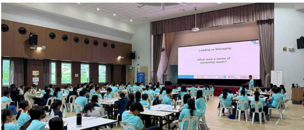
Day 2 of the ILTC progressed with the same enthusiasm and energy.