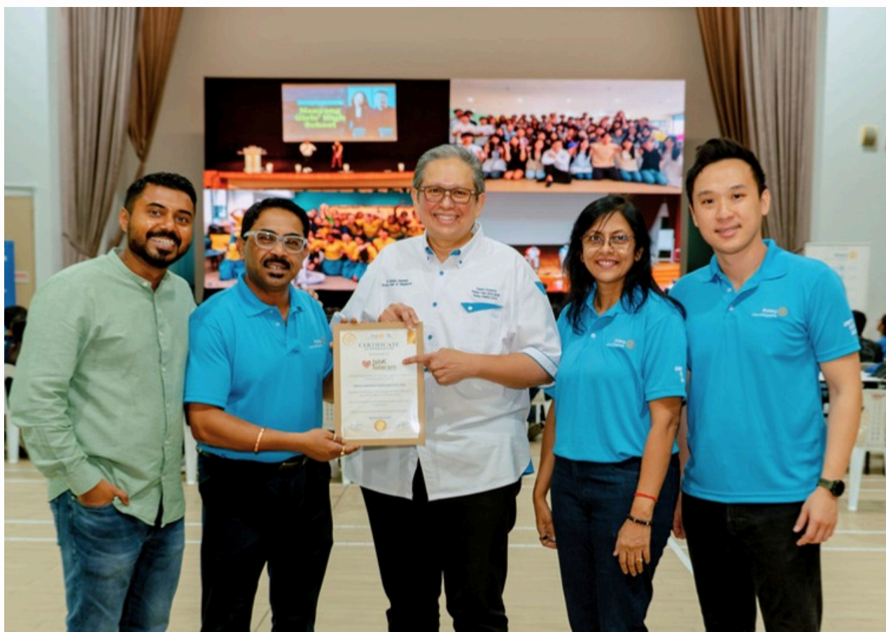
Photo-op with some of the leaders who made ILTC happen.