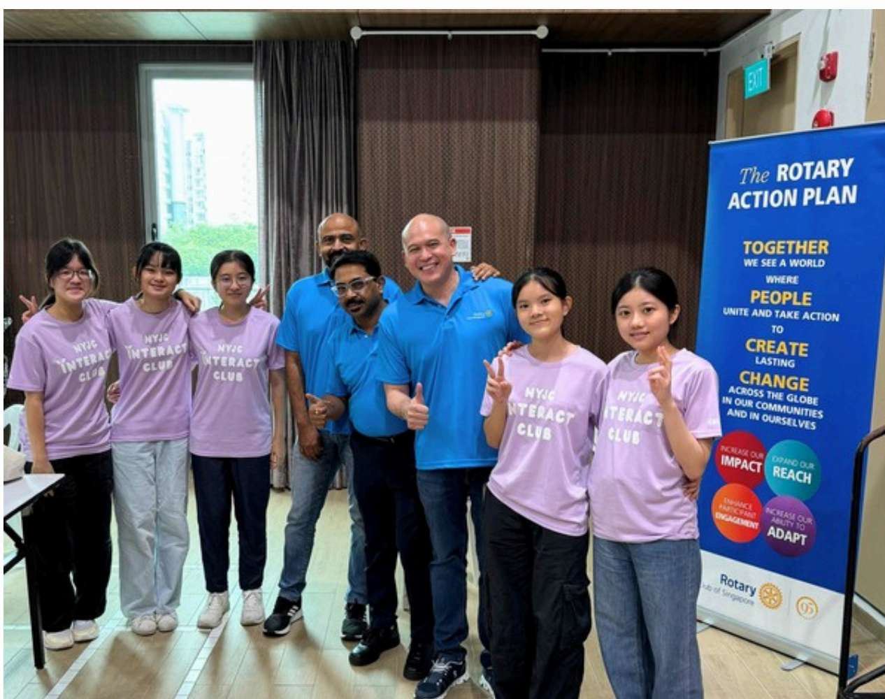
Downtime with the Nanyang JC Interact Club was an opportune time for a photo

A heartfelt thank you to all Rotarians, Teacher Advisors, Rotaractors, and youth sponsors for making this event a success. Together, we've inspired and prepared the next generation of Interact EXCO leaders to lead with purpose and service.