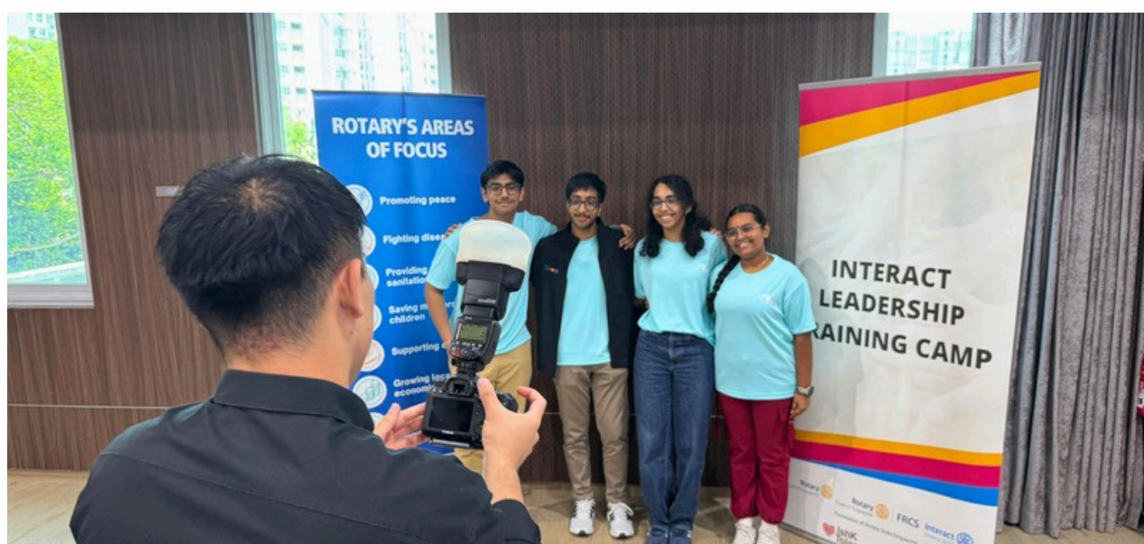
Some Interact Leaders shared their projects with tabla!