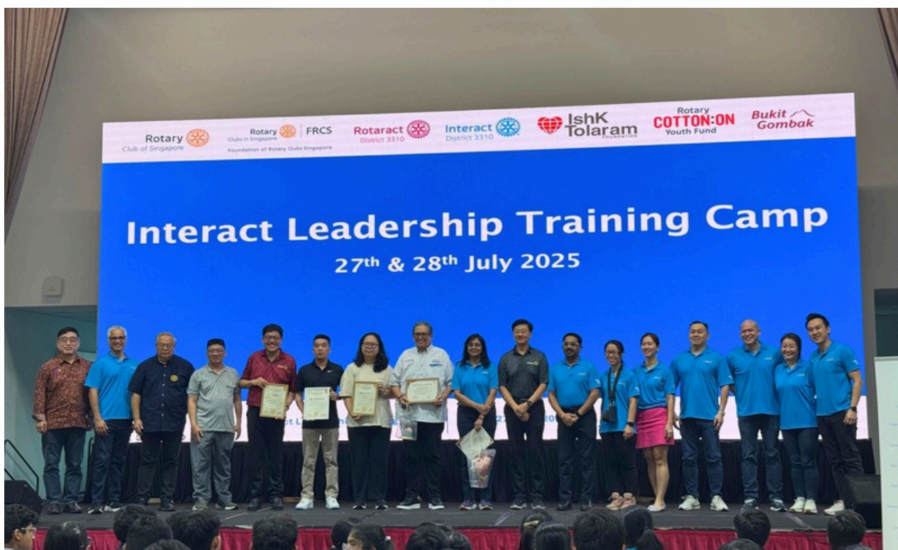
Rotarians who were present on Day 1.