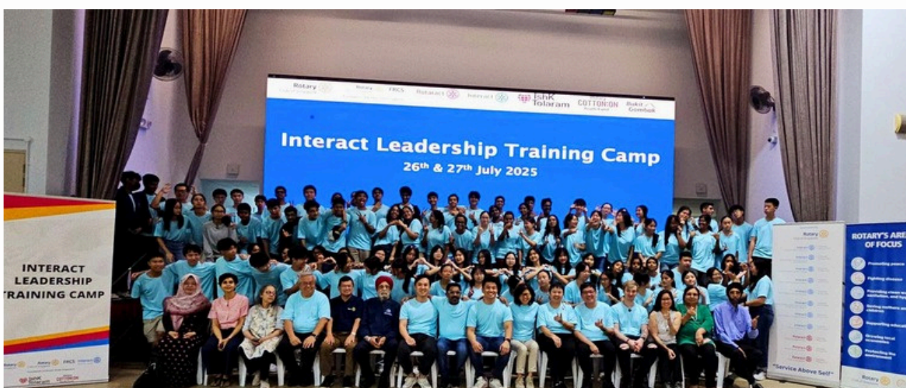
Day 2 ended with another group picture and many unforgettable moments of fellowship, creativity, and collaboration