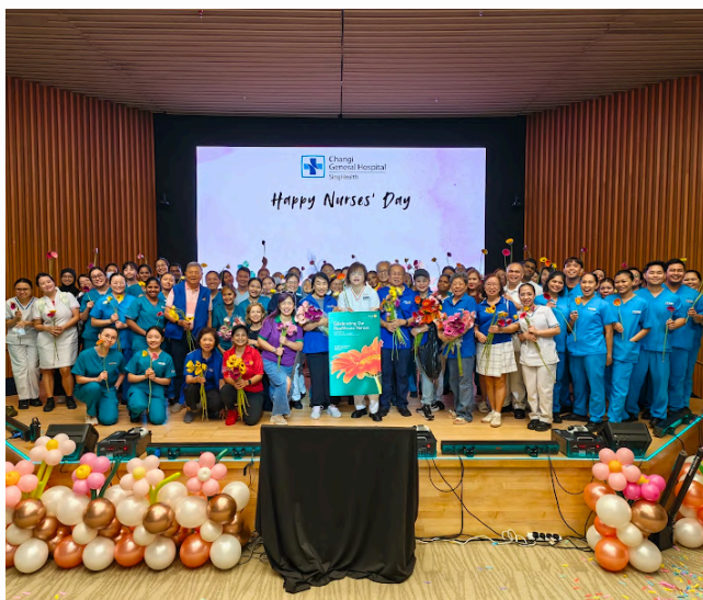
Changi General Hospital attended by RC Marina City, RC Pandan Valley, RC Jurong Town, and RC Singapore