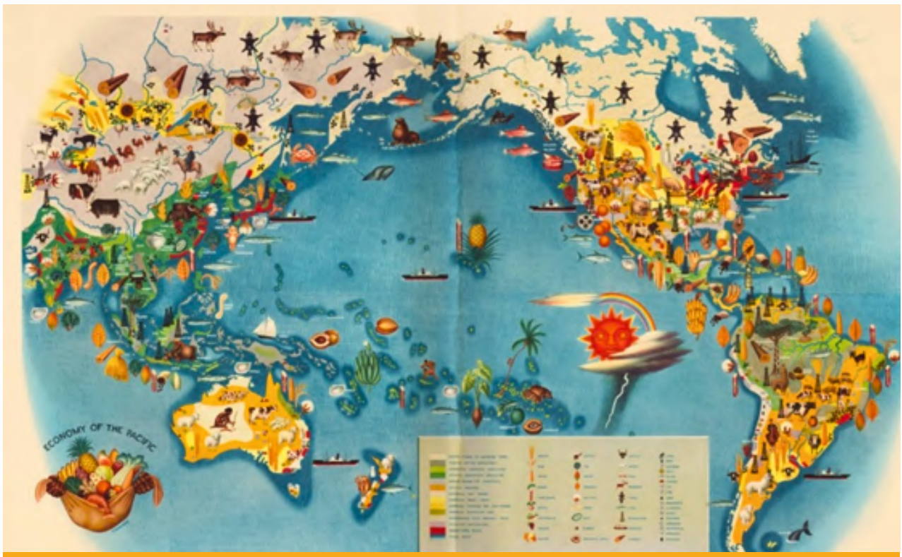
Paintings by Miguel Covarubius – Bali women and Pageant of the Pacific Map