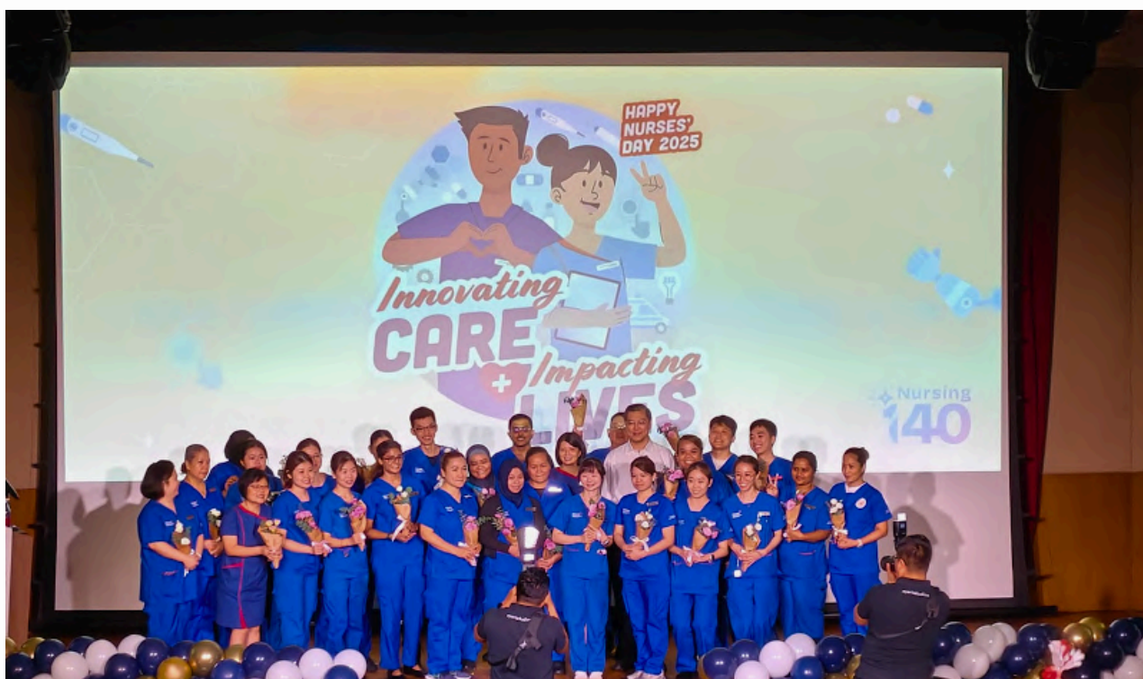
Ng Teng Fong General Hospital attended by RC Singapore East and RC Singapore