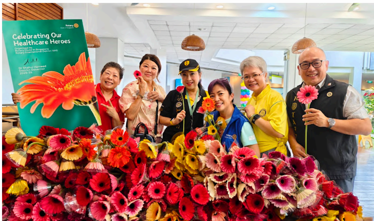
Gerbers ready for distribution

Celebrating Our Healthcare Heroes 2025 reached more than 13,500 nurses, recognising their tireless dedication with Gerber Daisies and a special treat — Harley Davidson rides!