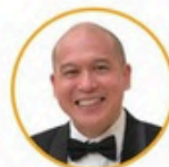
VJ Africa Public Image & PR Director