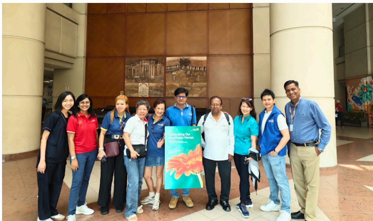
Tan Tock Seng Hospital attended by RC E-Club 3310, RC Pandan Valley, RC Marina City, RC Singapore Heartlands, and RC Singapore