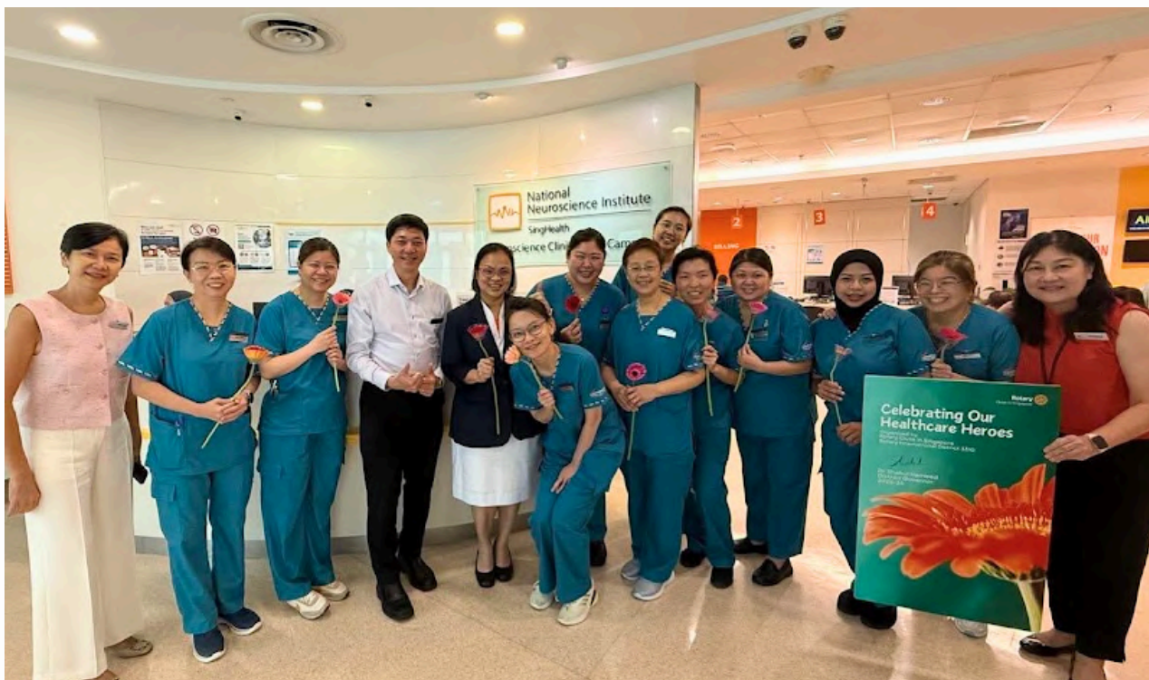
National Neuroscience Institute enjoy the festive and warm vibe of the activity