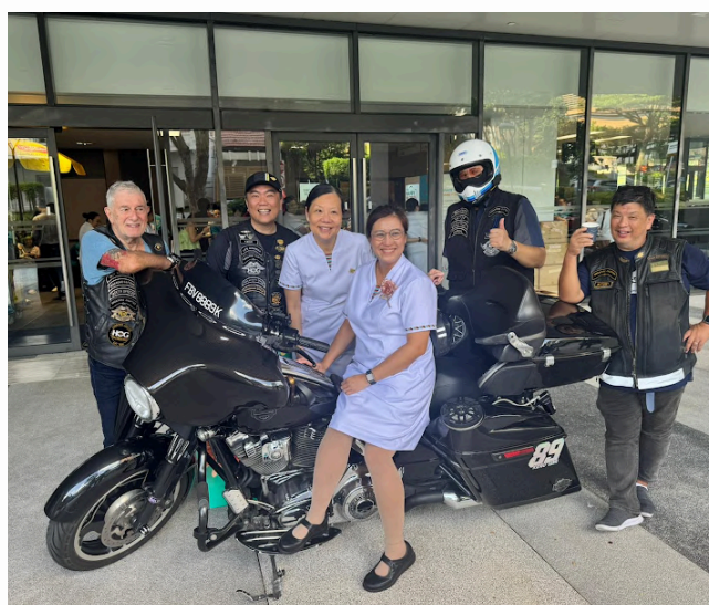
Harley's Owners Group provide the exciting motorbike rides