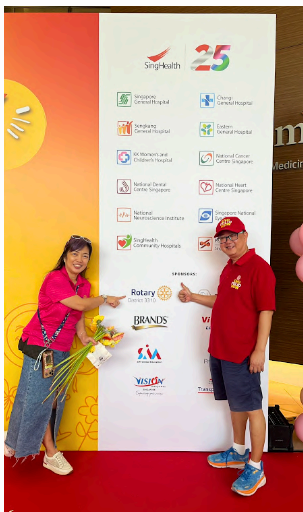
Rotary D3310 is a proud sponsor of the initiative

We would like to extend our warmest thanks to Rtn Agnes for leading such an extensive outreach program that involved so many Rotary Clubs in Singapore. She has truly showcased how People of Action make things happen!