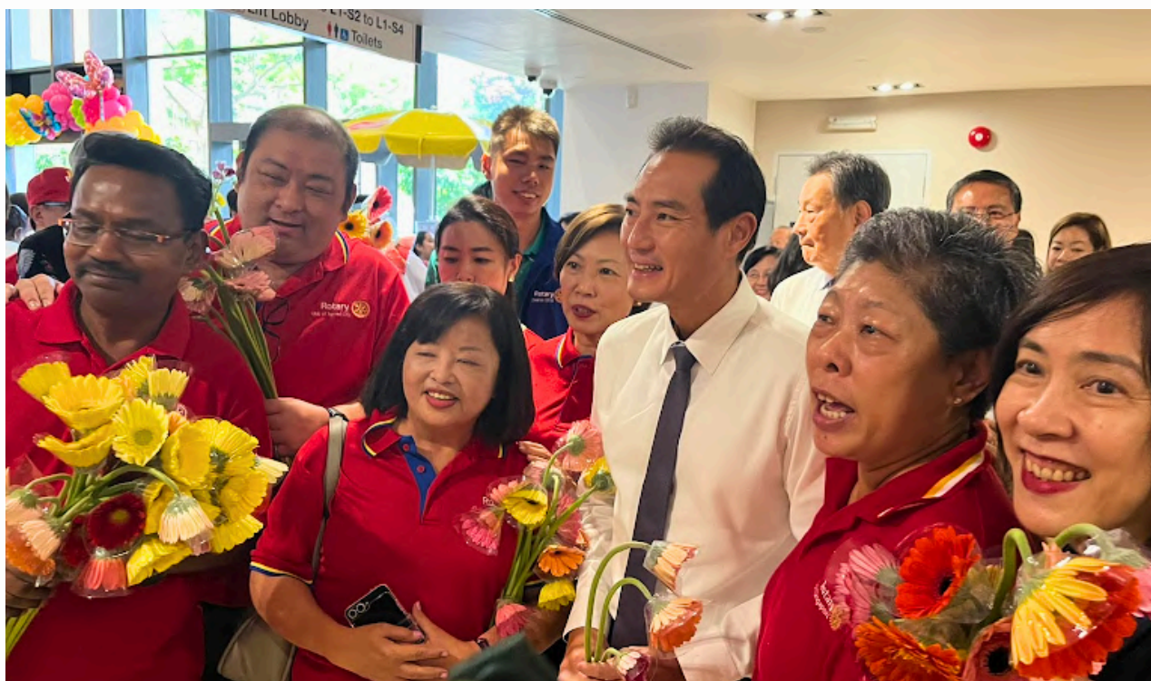
GOH Senior Minister of State Mr Tan Kiat How at Singapore General Hospital. Attended by RC Bugis Junction, RC Garden City, RC Jurong Town, RC Marina City, RC Novena, RC Peace Builders, RC Queenstown, RC Sentosa, RC Singapore East, RC Suntec City, RC Tanjong Pagar, and RC Singapore