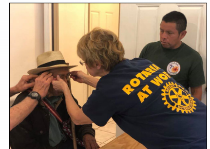
Glasses being fitted to indigenous Mayan

With one simple act of kindness, YOU can change lives!