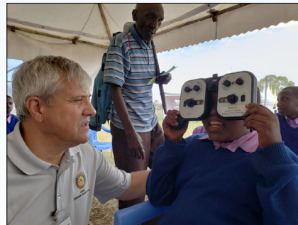
Measuring the vision of a Kenya student

Many do not realize used eye glasses need to be cleaned, adjusted, measured, packaged, cataloged, and shipped prior to making someone else's life for the better. Even though we are an entirely volunteer organization, and have no labor costs, we must still purchase and maintain equipment and supplies and provide for the measuring, sorting, packaging, and shipping costs of the glasses. We humbly ask for a small donation (suggested $10/pair) to supplement our costs.