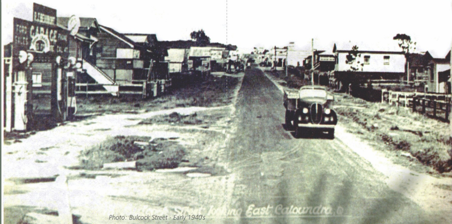
Photo: Bulcock Street - Early 1940's