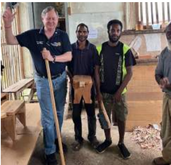
Creative Help Centre

Next, we headed to Madang, a stunning area we didn't get the chance to visit last year, to connect with the Madang Rotary Club.