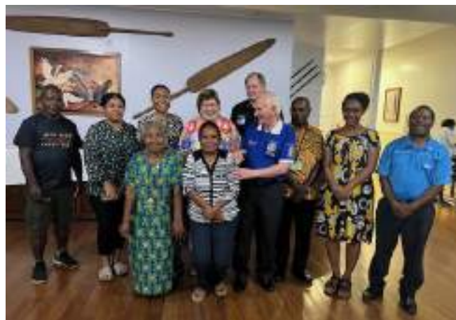
With members of Madang Rotary Club

The club is making a difference in the community with their latest project to upgrade pedestrian crossings in the town. Many members are also deeply involved with the Creative Help Centre, which focuses on empowering people with disabilities to fully participate in society according to their abilities and choices.