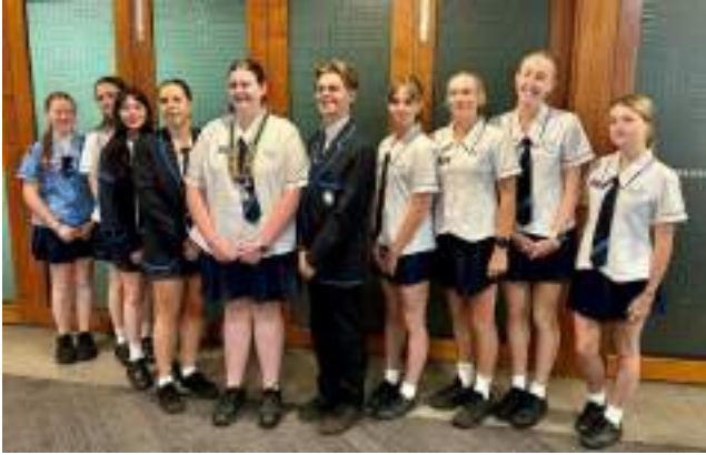
Kawana Waters State College Interact members

Monday 11 November 2024 was a celebration of Youth at the Mooloolaba Rotary Club: a celebration of the achievements of Kawana Waters State College (KWSC) and Immanuel Lutheran College (ILC) Interact Clubs and a testament to their service to others.