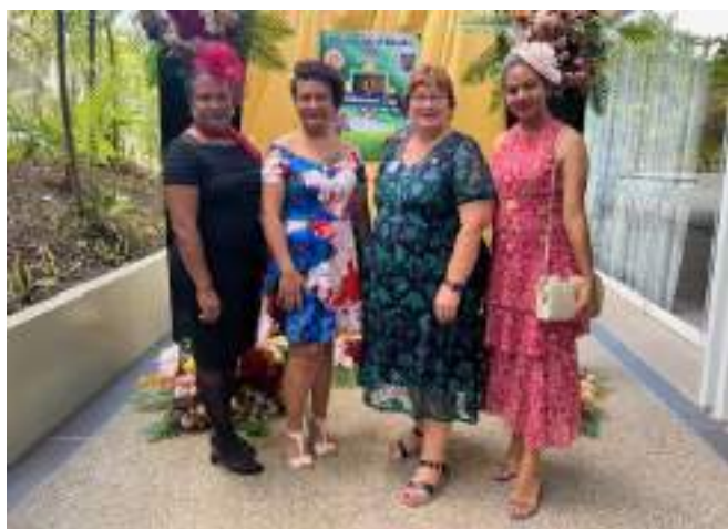
Some of the fashions on the day

The first day was spent with the Rotary Club of Boroko at their Melbourne Cup event – and what a day it was! The event, held in the grand ballroom of the Port Moresby Hilton, was another sell-out, with over 550 people attending.