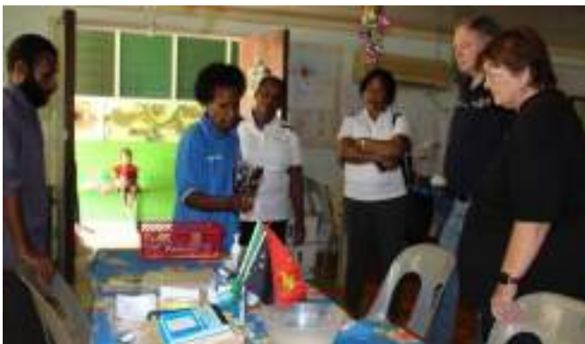
Visiting the Callan Ear and Eye Clinic

In the morning, we managed to squeeze in a quick drive around Wewak. We saw where the desks for their desk project are manufactured and visited the Callan Ear and Eye Clinic. It was inspiring to see the incredible services they provide with such limited resources.