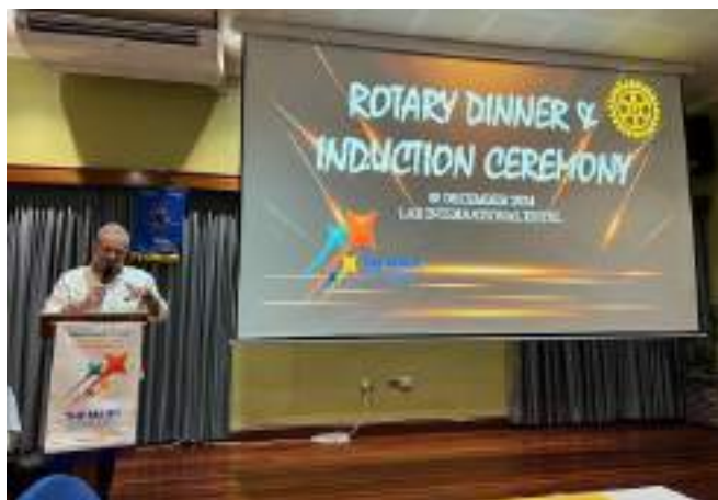
In Lae at the Club meeting and at the school

The highlight was their computer lab, which houses 21 computers powered by Teacher in the Box. It's incredible what the school staff have accomplished—student enrolment has doubled in just a few years, growing from 350 to over 700!