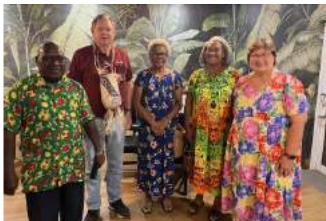
With Kokopo Rotarians