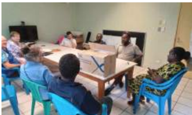
Gizo Hospital and Rotary members during a discussion.