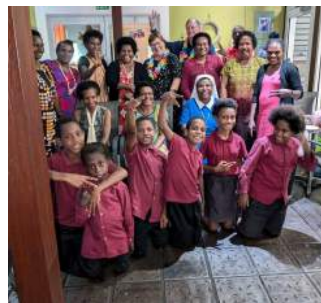
Wewak Community Corps and Rotakids

The next day started early, but delays at the airport meant we couldn’t visit as many projects and schools as we had hoped. However, we had the pleasure of sharing dinner with members of the Wewak Community Corps and some enthusiastic Wewak Rotakids, who are busy planning projects in their school.