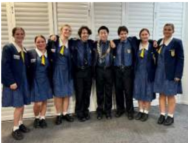
Immanuel Lutheran College Interact members