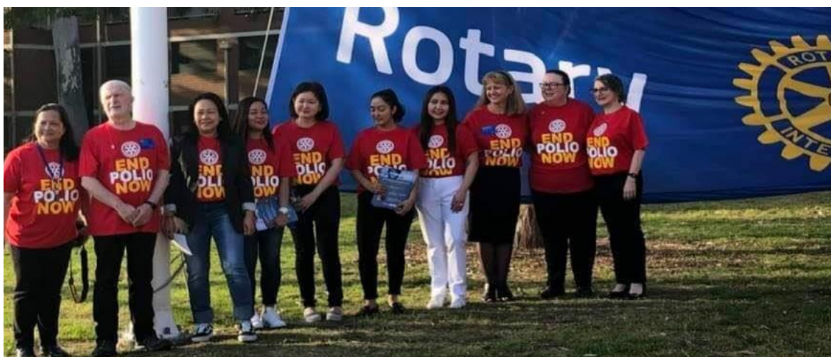
RISPPO Staff Celebrating World Polio Day in 2019