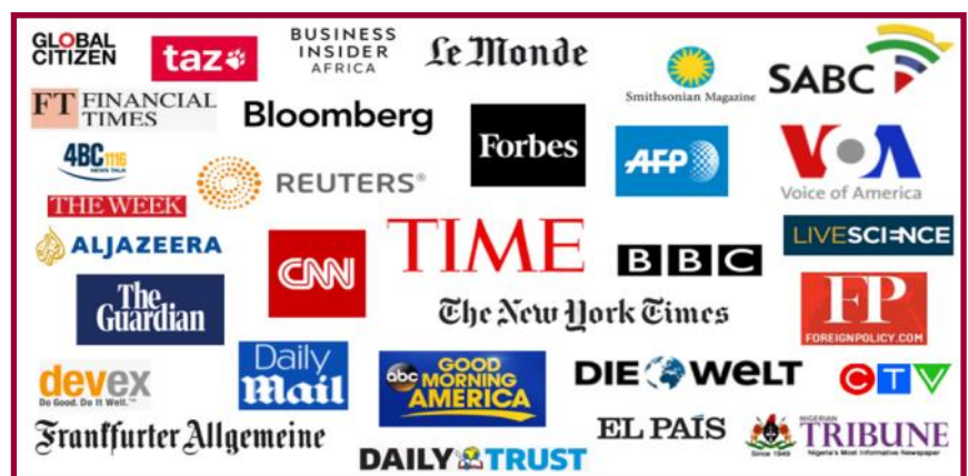
World Media Outlets reporting on African polio-free certification

Social media posts on Rotary's channels reached 4 million people and resulted in 517,000 video views and 93,000 likes/comments/shares . Celebrities like John Cena, Ade Adepitan and Itzhak Perlman posted and tagged Rotary on social media. Between 25-27 August, Rotary was mentioned more than 22,000 times on Twitter and Instagram.