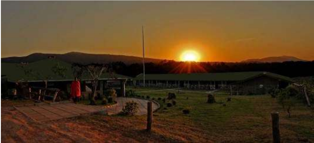
Overlooking Rhino Lodge