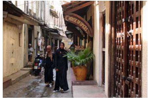
Stonetown and its twisting narrow streets