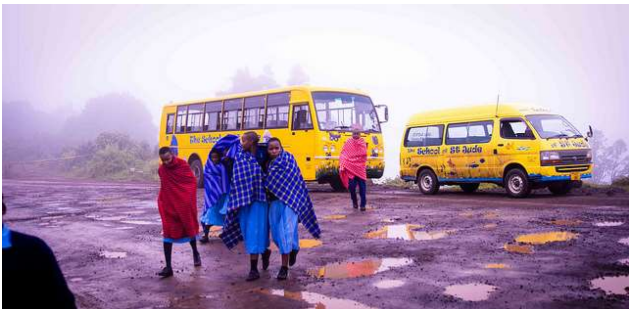
The School of St Jude