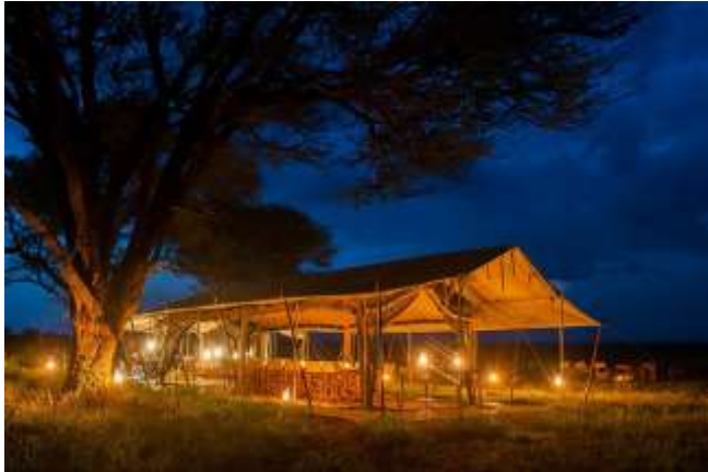
Serengeti Safari Camp (above)