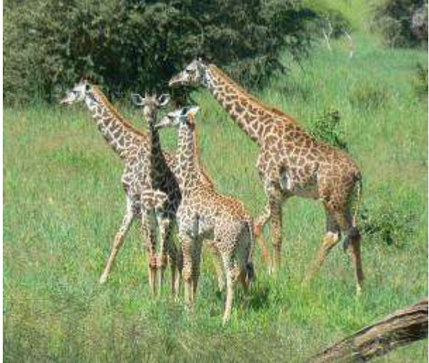
crèche for young giraffe