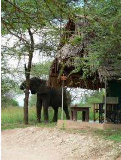
Looking from the Tarangire Safari Lodge into the Tarangire River below...