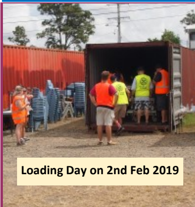
Loading Day on 2nd Feb 2019