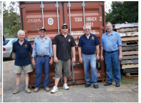
Volunteers from Adelaide, Melbourne, Sydney and Brisbane , representing Four RAWCS Regions Loaded the Catheterization Laboratory bound for Mongolia