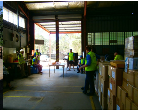
A Well Earned Tea Break after Finishing Loading for the Day