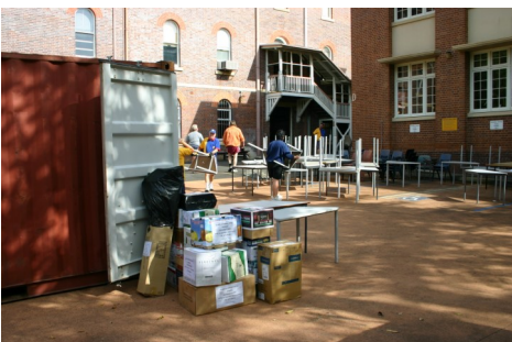
Loading of a Container of Donated Equipment at the TAFE College at Ipswich before it was Closed