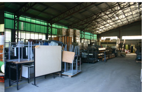
Inside the Durack Store