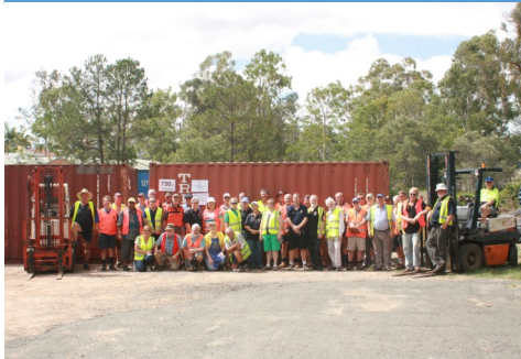
750th Container Loaded by these Volunteers in February 2014

This is the last of a series of photographs and covers the period when Donations in Kind was operating out of the Wesley Mission owned premises in Freeman Road, Durack