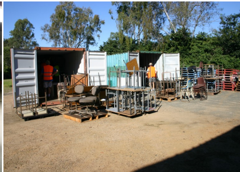
Another Loading Day at Durack