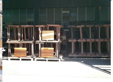
Sample of the Large Number of Schools Desks and Chairs that Past Through the Durack Store