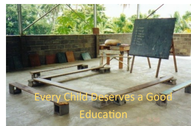
Every Child Deserves a Good Education