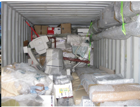
Loading of a Catheterization Laboratory bound for Mongolia