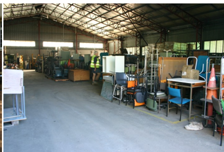
Inside the Durack Store