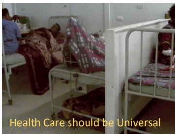
Health Care should be Universal