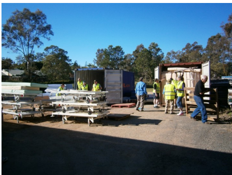
Yet Another Loading Day