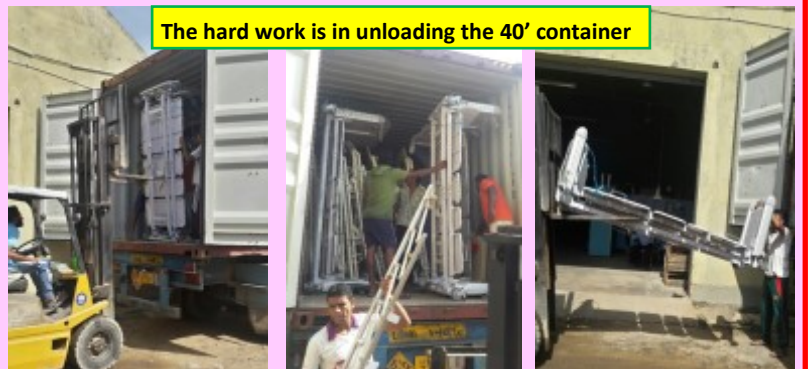
The hard work is in unloading the 40' container

Initiated this programme and now over 800 beds have been dispatched. It takes one person with an idea before good things happen in Rotary.