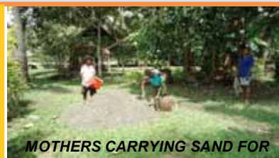
MOTHERS CARRYING SAND FOR A NEW SCHOOL OFFICE

Is there a Rotary Club prepared to adopt this as a project and provide the assistance through Donations in Kind