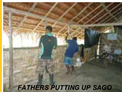
FATHERS PUTTING UP SAGO STALKS FOR CHILDRENS DIS-