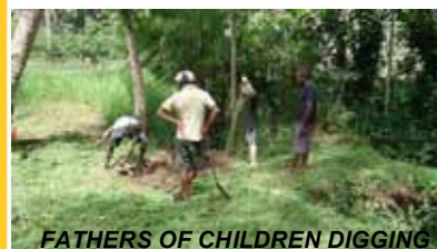
FATHERS OF CHILDREN DIGGING PIT FOR A NEW SCHOOL TOILET