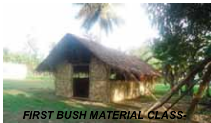
FIRST BUSH MATERIAL CLASS- ROOM