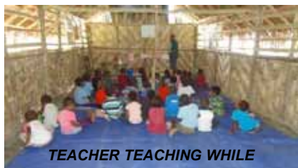
TEACHER TEACHING WHILE CHILDREN LISTENING AND WORKING